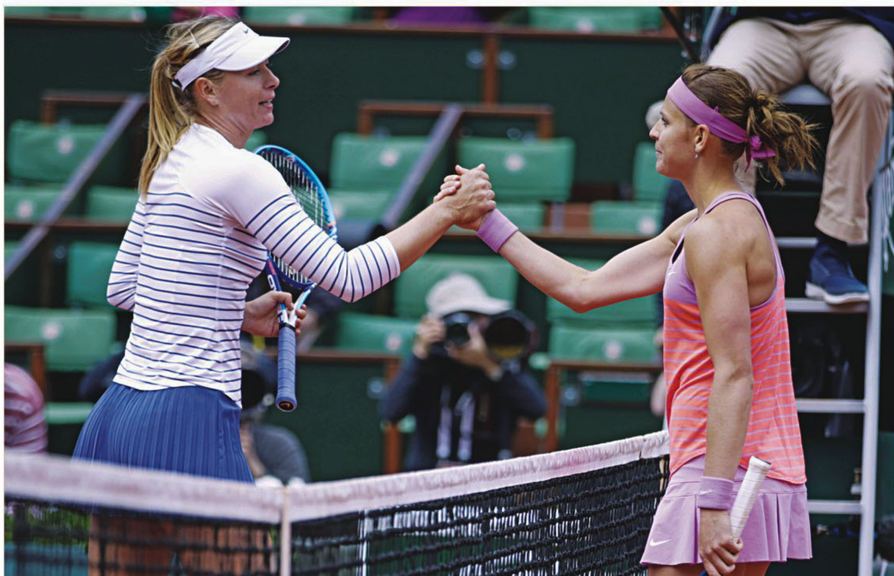
Defending champion Maria Sharapova (L) of Russia congratulates Czech Republic's Lucie Safarova after losing the French Open women's fourth round match in Paris yesterday.