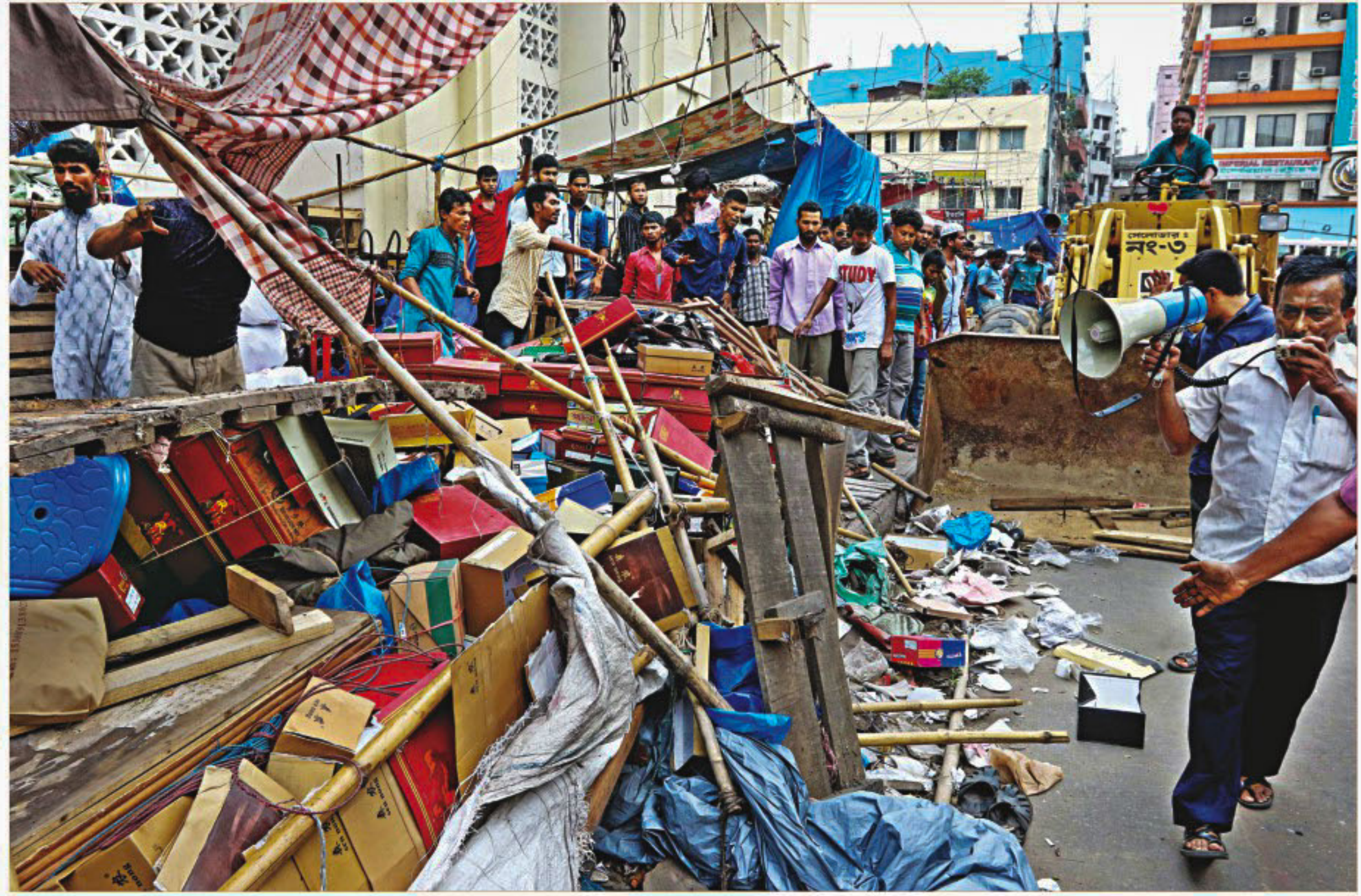
Dhaka South City Corporation evicts all structures erected by hawkers at Gulistan yesterday. The photo was taken in front of Baitul Mukarram Mosque. The hawkers had fled the scene before the drive began.