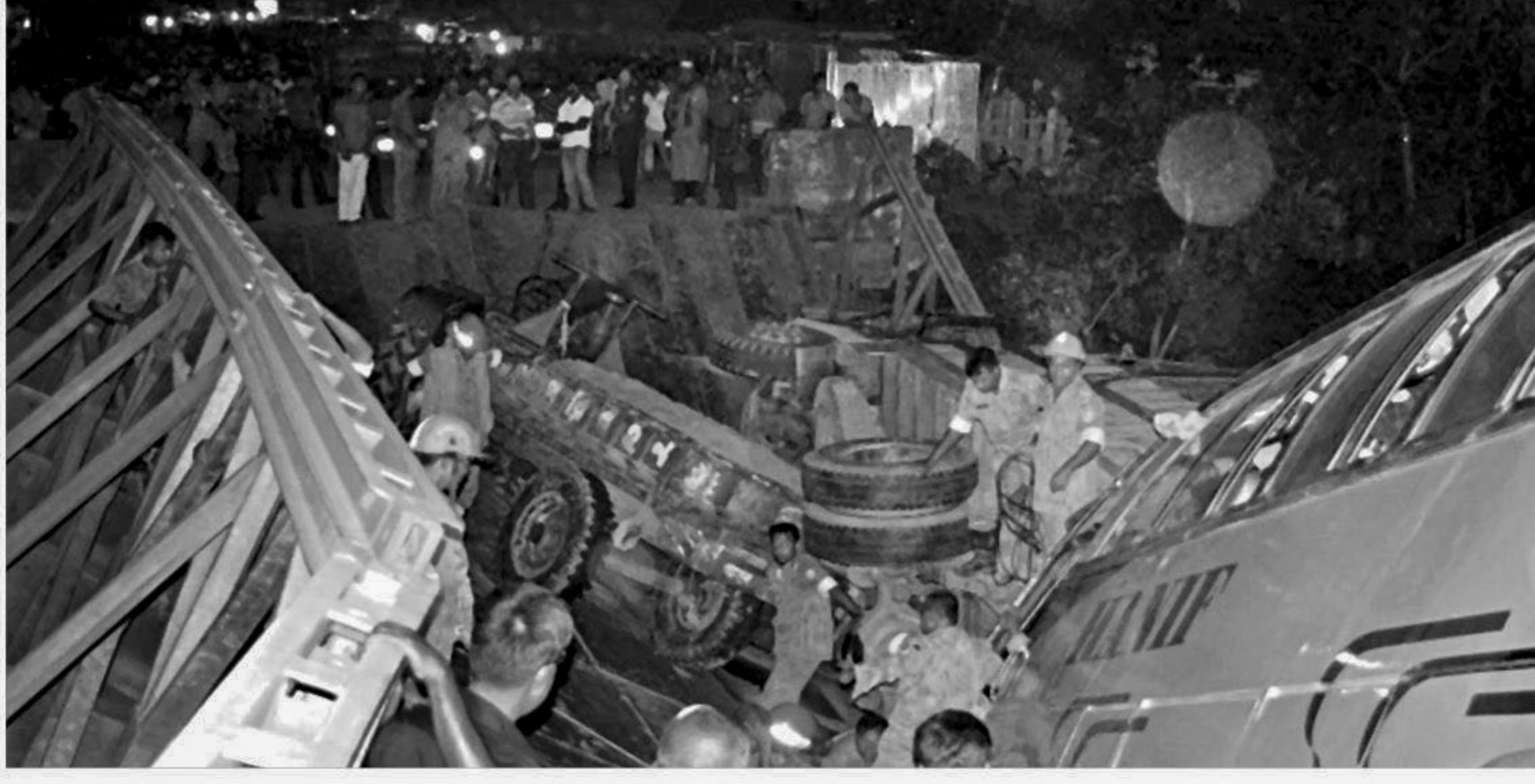
Six vehicles, including trucks and a bus, fell into the dry Isamoti River when a bailey bridge collapsed yesterday, halting vehicular movement on the Dinajpur-Gobindaganj highway. At least 25 people were injured, reports UNB.

Panthapath Road's southern lane and CR Dutta Road have been closed to traffic and people. City corporations' officials estimate around 1,000 truckloads of sand has been dumped to stabilise the hotel and adjoining area. NBL contractors say another 1,500 truckloads was being poured.