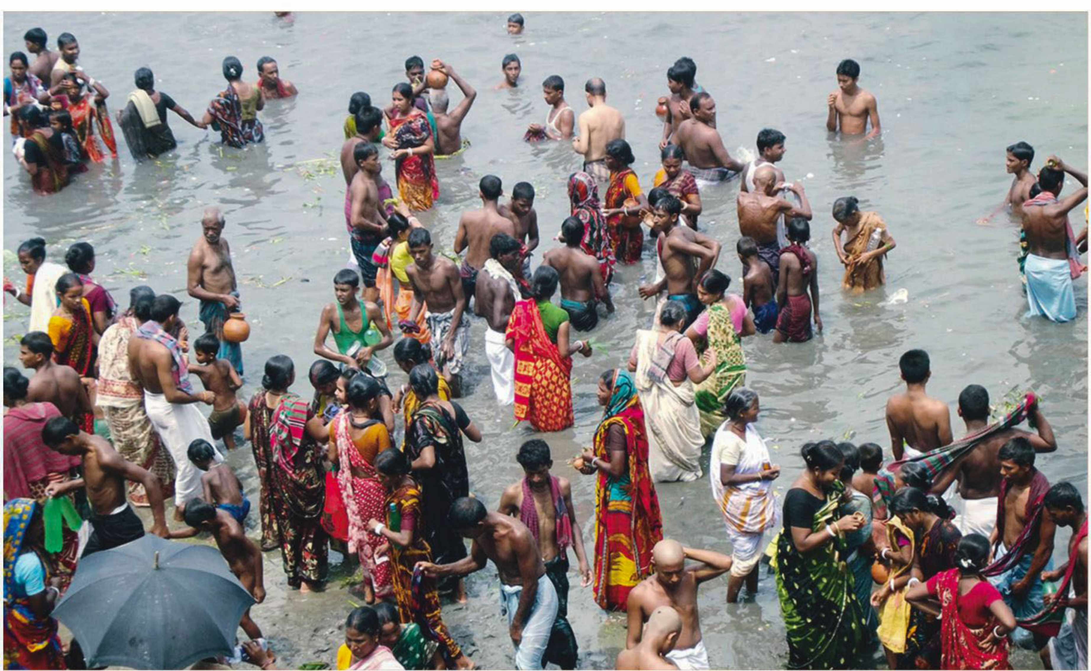
Members of the Hindu community take a holy dip or perform Ganga Snan, a symbolic gesture of washing away sins, in the Pagla river, a tributary of the Padma, from the Ganga Ghat, adjoining Ganga Ashram and a cremation ground, south of the Kansat bazar in Chapainawabganj's Shibganj upazila yesterday. The local community leaders say the ritual is held during "Ganga Doshhara Tithi" of Jaishttha and Ashar of the Bangla calendar.