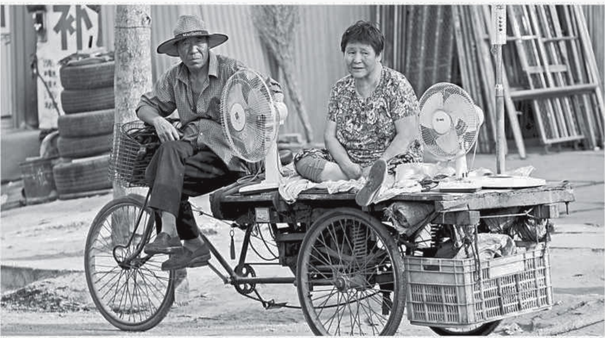
Vendors selling secondhand electric fans wait for clients at a market for migrant workers in China.