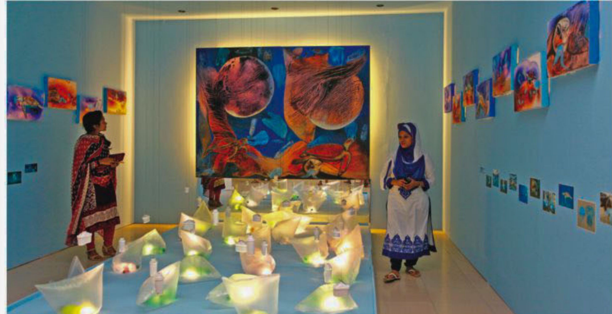
An installation by Gulshan Hossain.

The objective of this exhibition is to bring together artists belonging to different age groups, working in different mediums and techniques. The event has also become a platform, encouraging exchange of ideas between artists, critics and art enthusiasts. The exhibition, opening from 11am to 8pm (3pm to 8pm on Fridays) will continue till June 13.