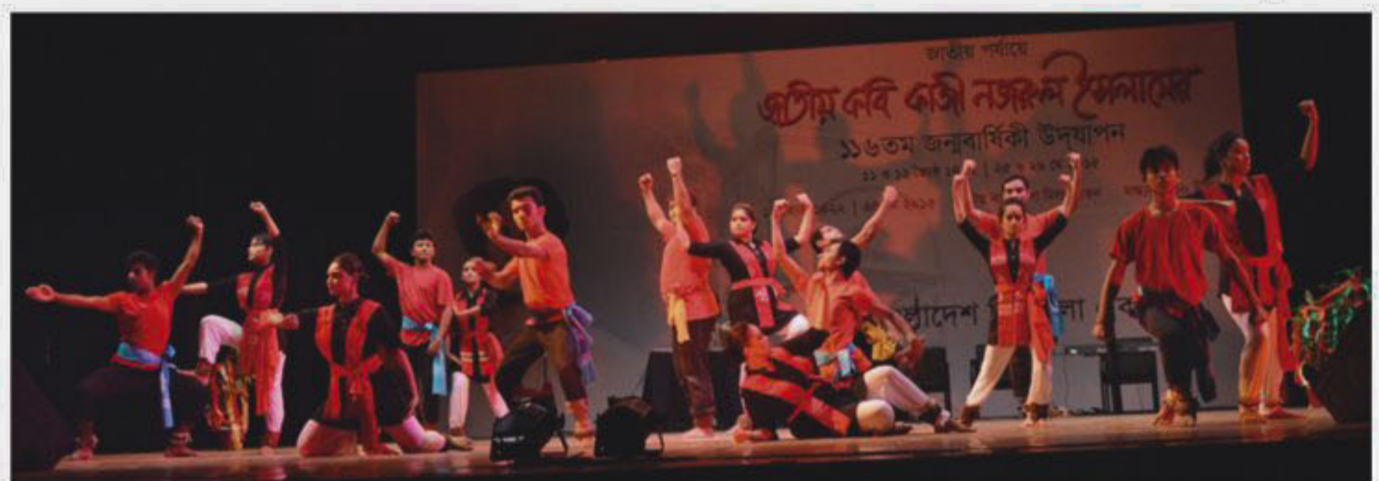
Artistes perform at the event.