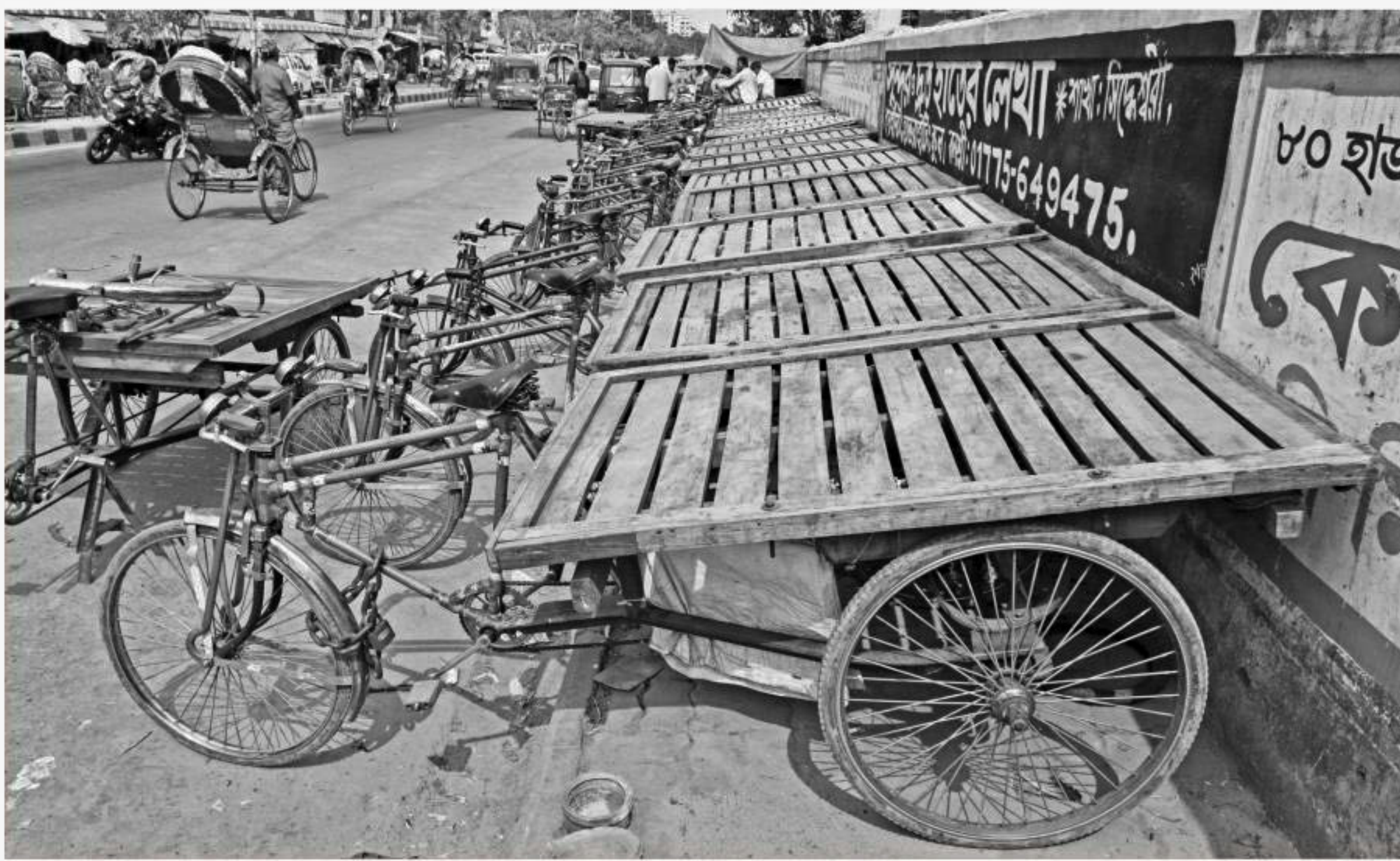
This newly constructed footpath beside the level crossing in the capital's Malibagh completely occupied by rickshaw-vans forcing pedestrians to walk on the road as the authorities concerned are nonchalant. The photo was taken on Monday.

At a human chain, organised on the campus by the political studies department, they demanded immediate arrest of the miscreants who on Thursday gang-raped a Garo woman in a moving microbus in the capital. They also demanded punishment for Papan.