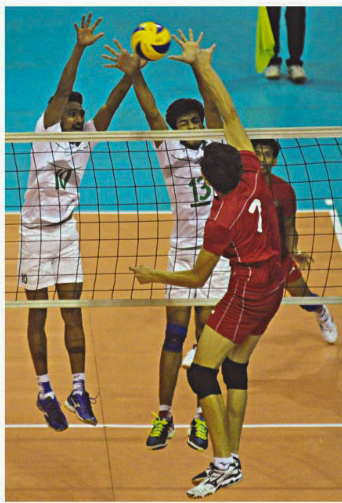
Two Bangladesh players attempt to block a smash from a Kyrgyzstan player during their Asian Men's Senior Volleyball Championship match at the Shaheed Suhrawardi Stadium in Mirpur yesterday. Bangladesh's efforts were not enough as they lost the match in straight sets.

Later, he joined Imperial College of London in 1962 and completed his PHD there. He then became a teacher first in the physics department and then at the applied physics department