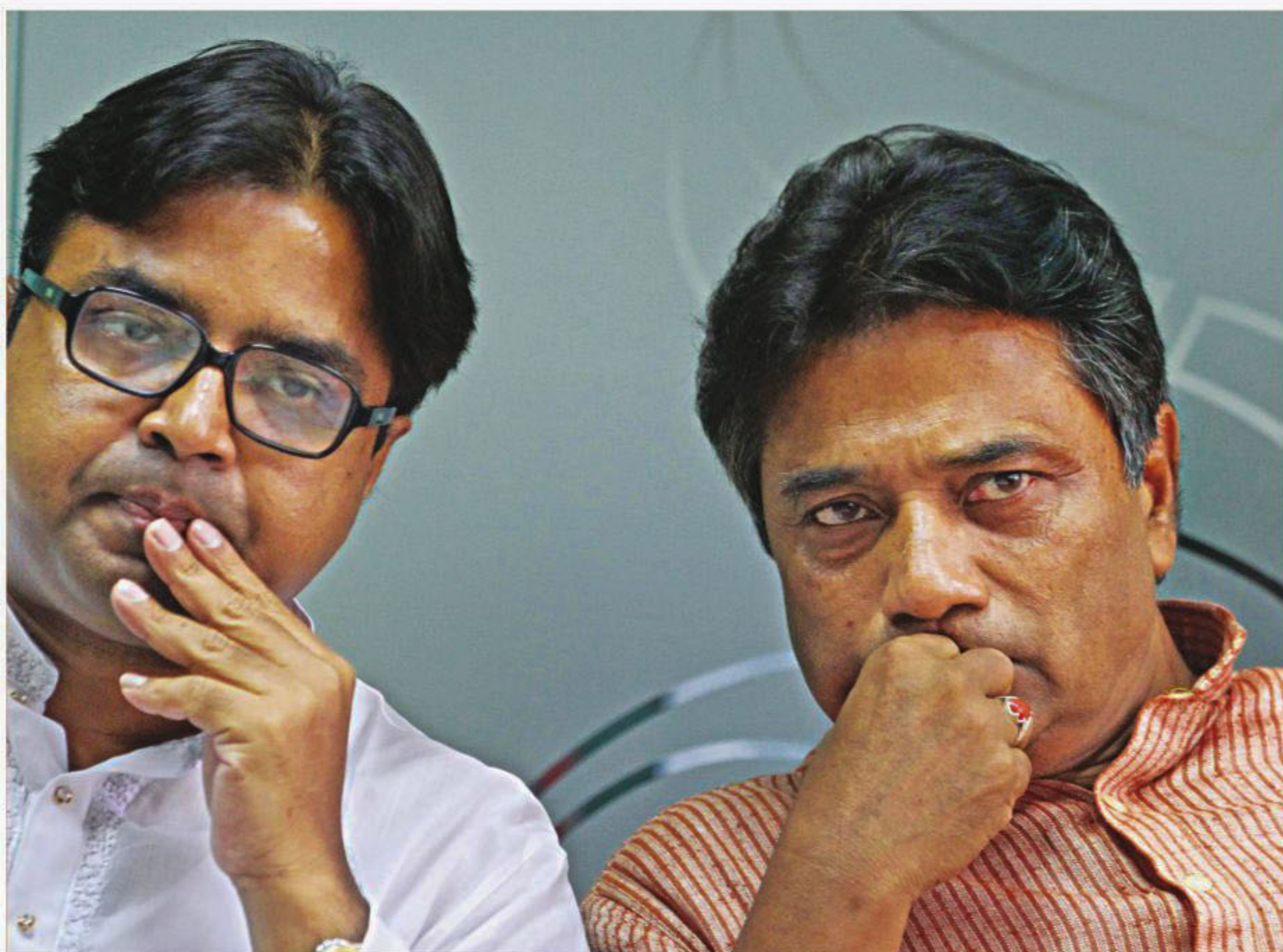
DSCC and DNCC mayors Sayeed Khokon, left , and Annisul Huq at a discussion "Towards a new Dhaka: Possibilities and Challenges" held at The Daily Star Centre yesterday.