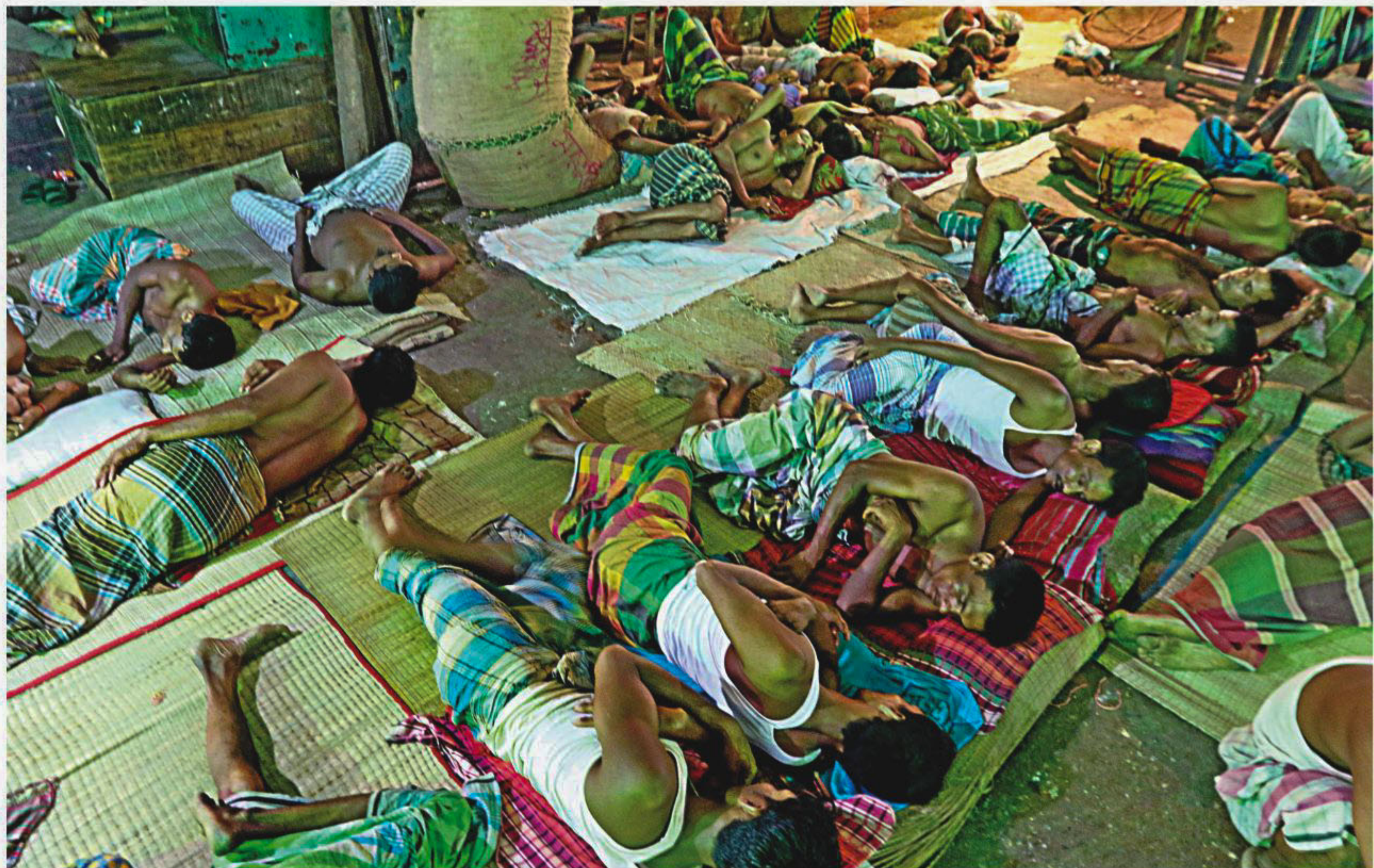
Workers of Karwan Bazar wholesale market take a nap on the floor yesterday afternoon as they try to deal with the sweltering heat. The temperature was recorded at 36 degrees Celsius in Dhaka yesterday, the highest of the week. There is no good news about the heat cooling down anytime soon. The Met office says the sultry weather will continue until there is rain.