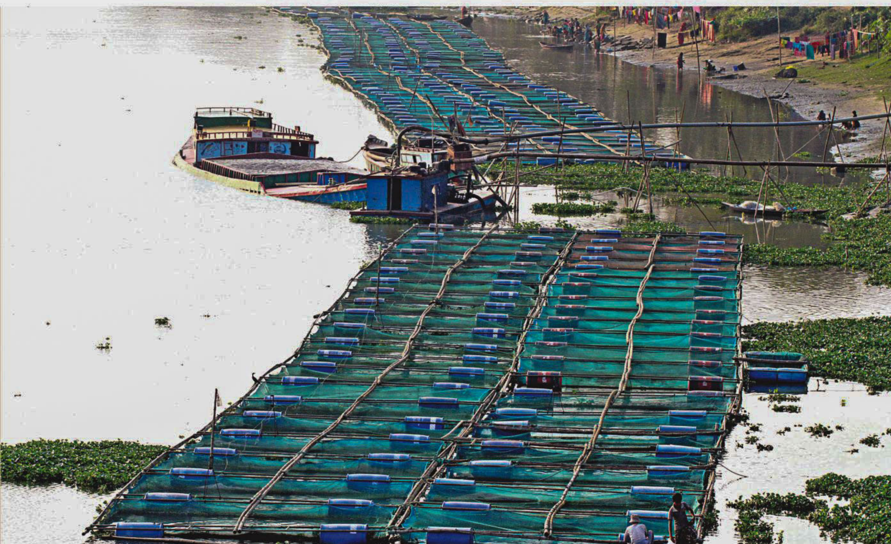
Hundreds of cages have been set up by fishermen and local youths for farming Telapia fish off both banks of the Dakatia River in Chandpur, however, the practice draws criticism from water transport owners who complain of disruptions in plying of vessels on the river. The photo was taken recently.

Mild to moderate heat wave may continue in Rajshahi and Khulna divisions and the regions of Dhaka, Tangail, Faridpur, Madaripur, Chandpur, Noakhali, Barisal and Patuakhali. Day and night temperatures may rise slightly over the country. The sun sets in the capital today at 6:38pm and rises tomorrow at 05:12am.