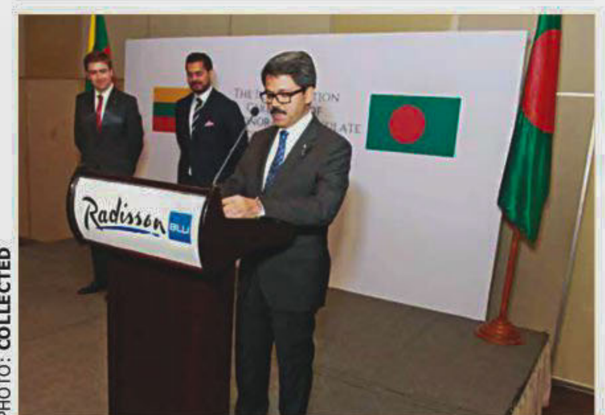
State Minister for Foreign Affairs Shahriar Alam addresses guests at the inauguration of the Consulate of Lithuania in the capital this month. Also in the photo are Lithuanian Ambassador Laimonas Talat-Kelpsa and Consul of Lithuania in Dhaka Mishal Ali.

WaterAid Bangladesh also announced "Rain Day" on June 15 as an initiative to reserve rain water.