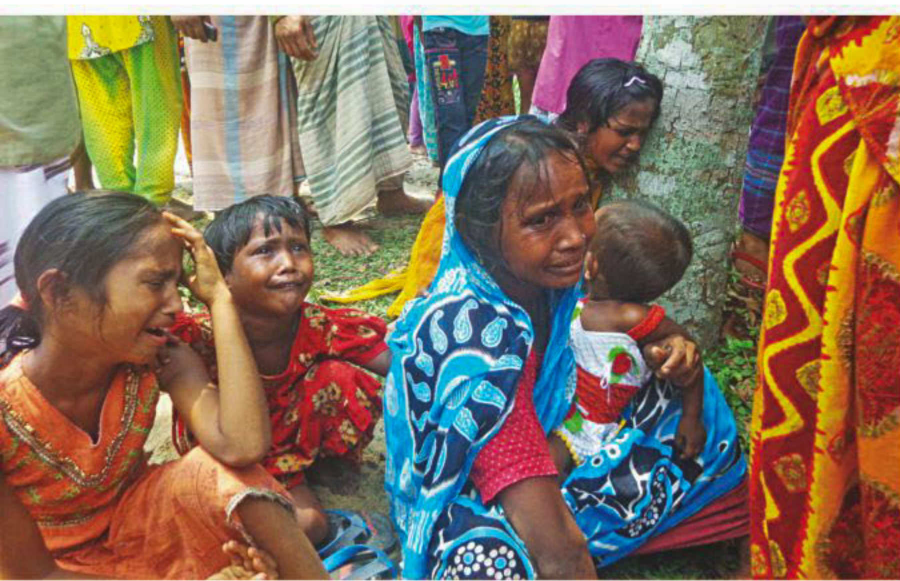
Relatives break down in tears at the death of loved ones as six people, including three of a family, were killed in a road accident when a truck rammed into a battery-run auto-rickshaw on Panchagarh-Tentulia highway at Charmile of Panchagarh yesterday.