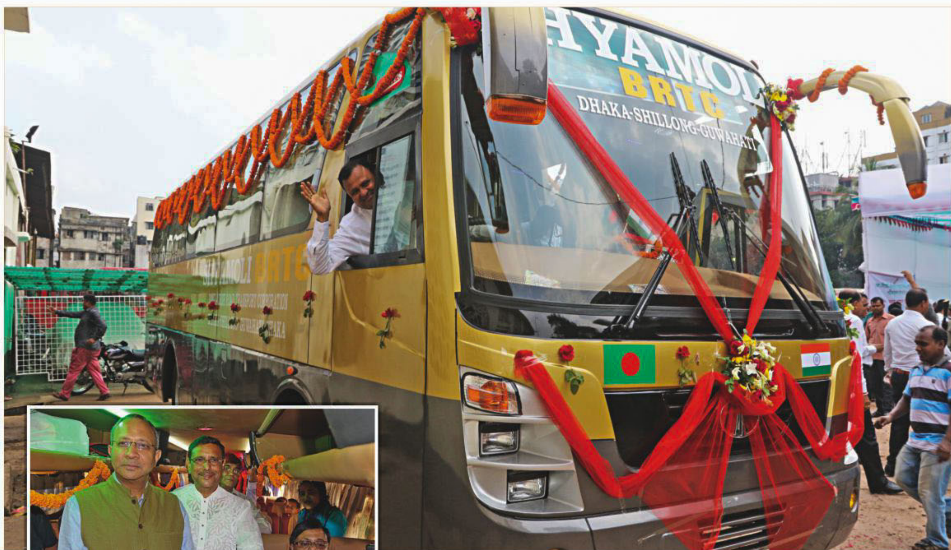
The trial operation of the Dhaka-Sylhet-Tamabil-Dauki-Shillong-Guwahati bus service at Kamalapur bus depot of BRTC was inaugurated by, inset, Road Transport and Bridges Minister Obaidul Quader and Indian High Commissioner Pankaj Saran yesterday.