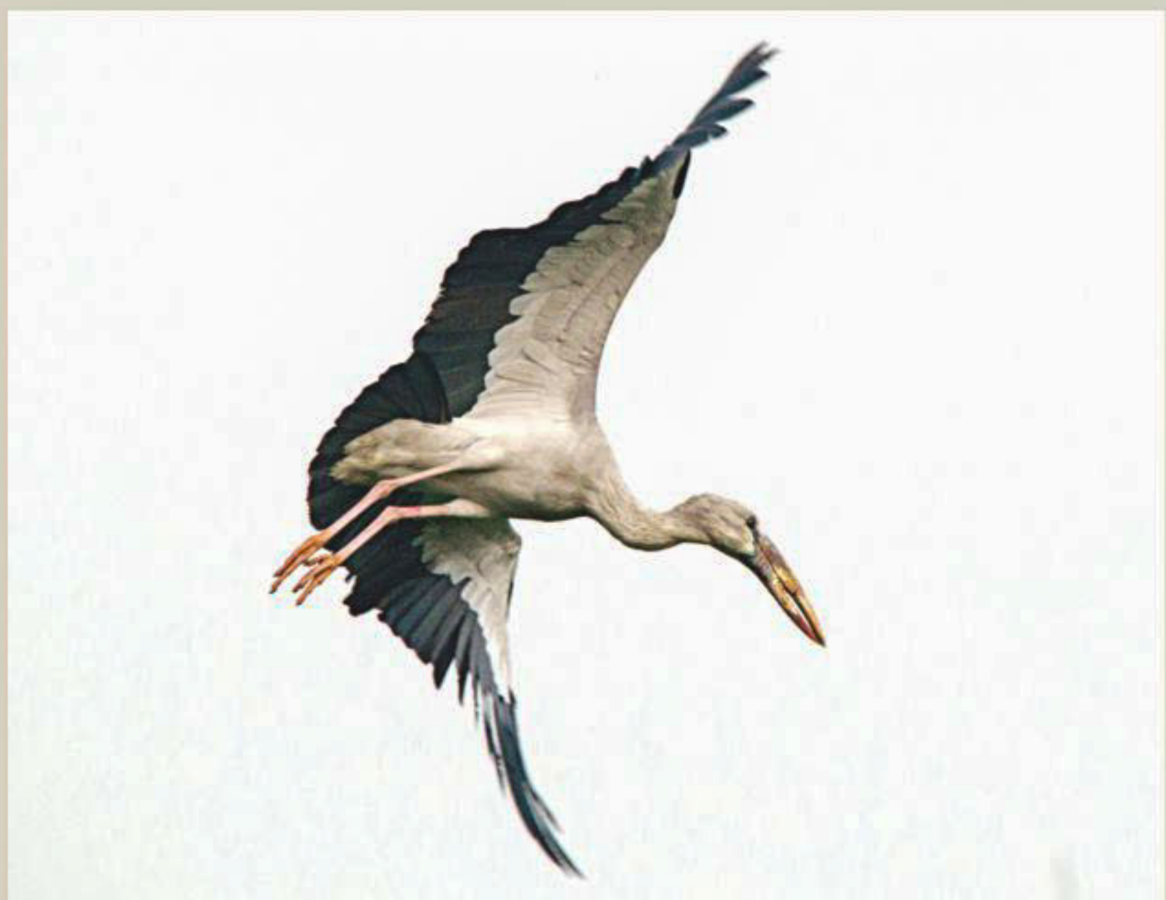
Asian openbill near Bhairab.