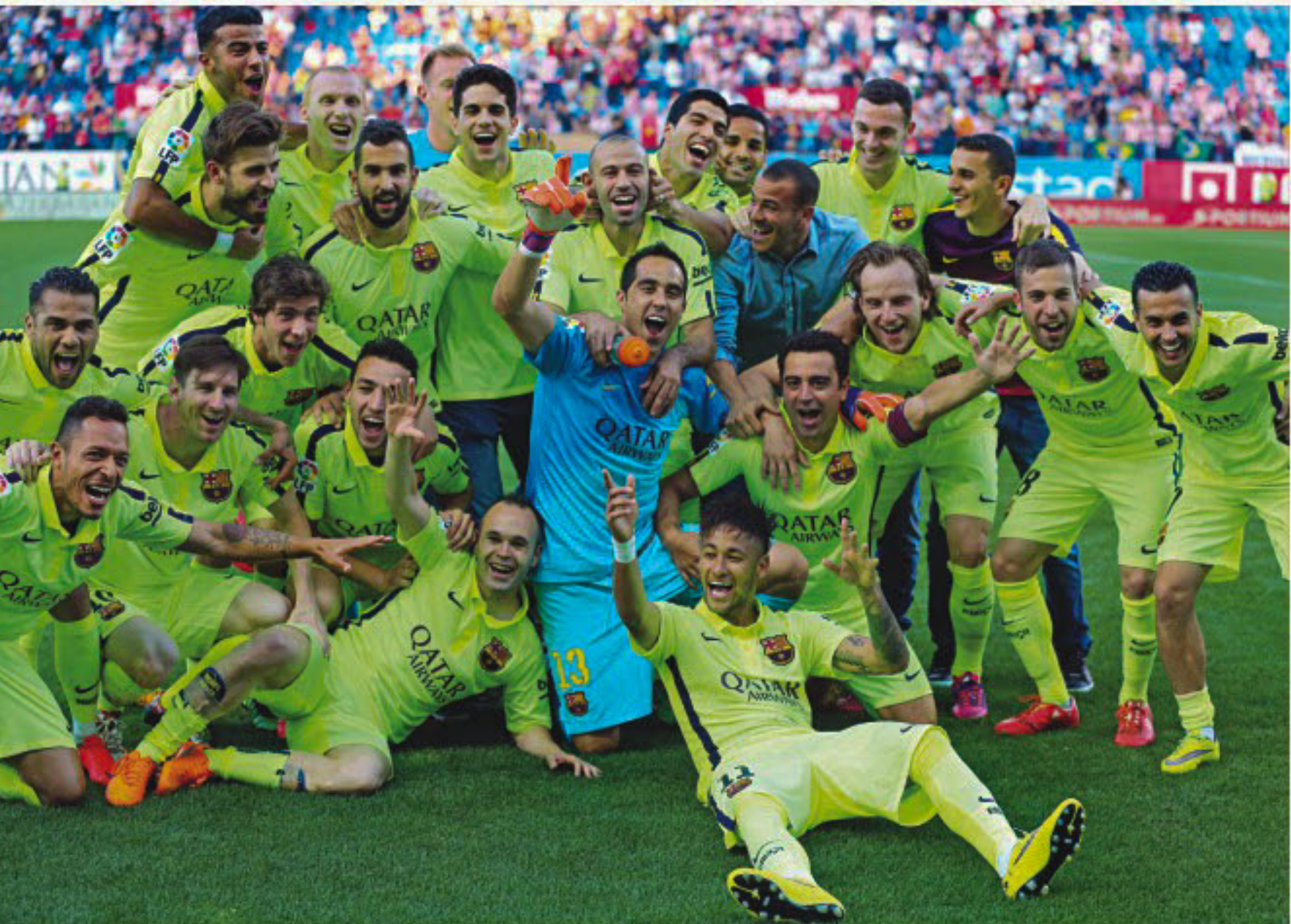
Barcelona players celebrate after securing their 23rd La Liga title at the end their match against Atletico Madrid at the Vicente Calderon Stadium on Sunday.