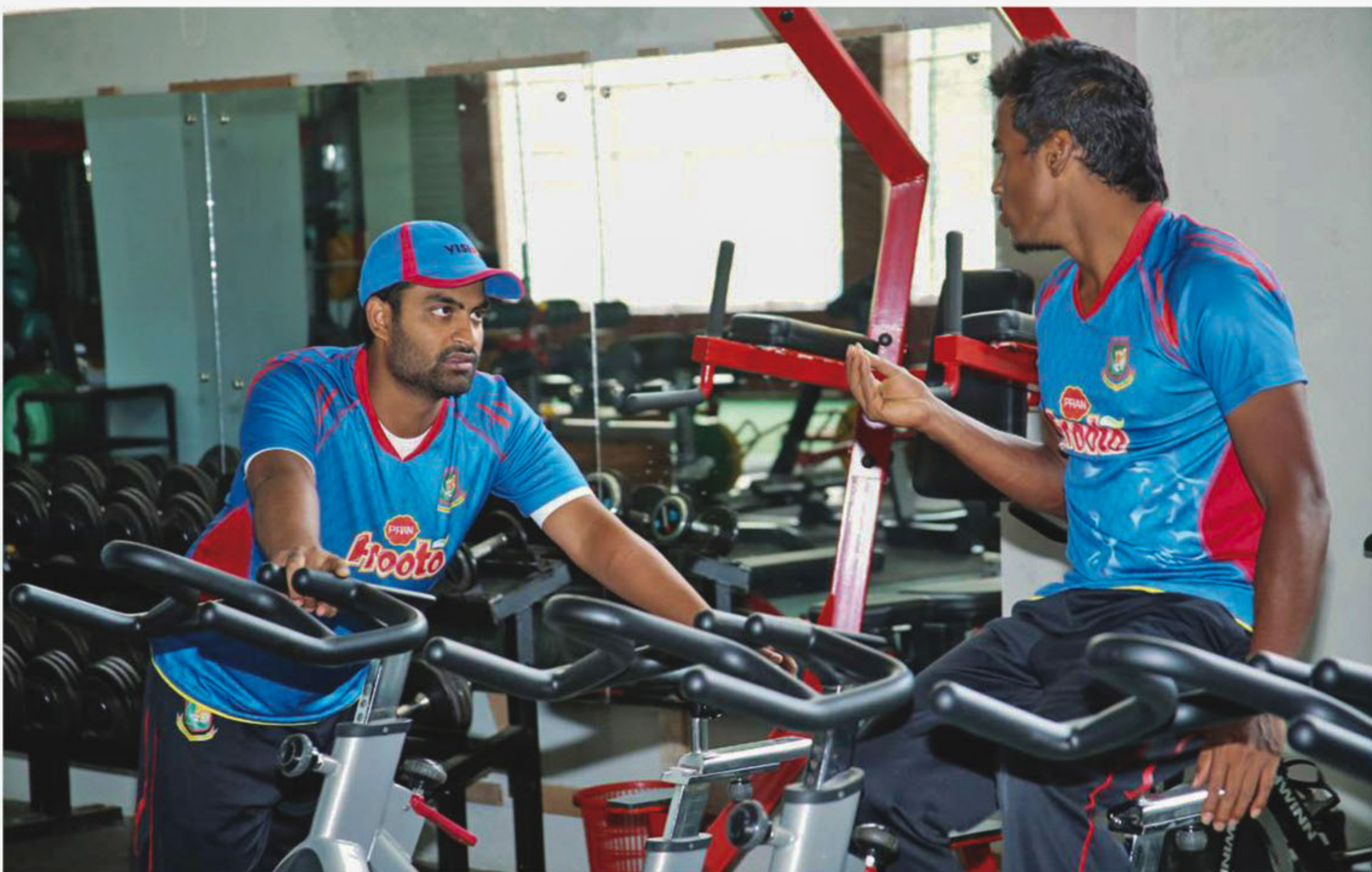
Bangladesh opener Tamim Iqbal (L) and paceman Rubel Hossain spent a lot of time at the Sher-e-Bangla National Stadium gym on Monday as they get ready for the forthcoming home series against India, who arrive in Dhaka on June 7 to play one Test and three ODIs.

Kiwi coach Mike Hesson said the two have remarkably improved and complete the team. England batsman Ian Bell also praised the duo, saying that their greatest quality was the ability to swing the ball late.