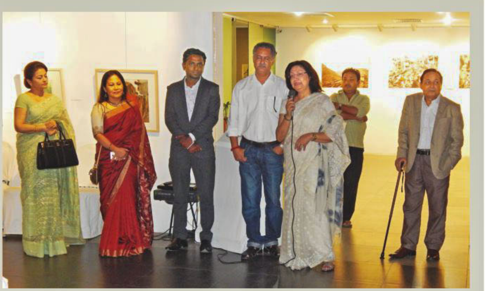
A fundraising painting exhibition to support Nepal began at Athena Gallery of Fine Arts in the capital on May 17. The exhibit features works of prominent artists of Bangladesh who have come forward to support the Earthquake victims of Nepal. The paintings are priced much lower than usual so that people can buy them and contribute to the Nepalese people.