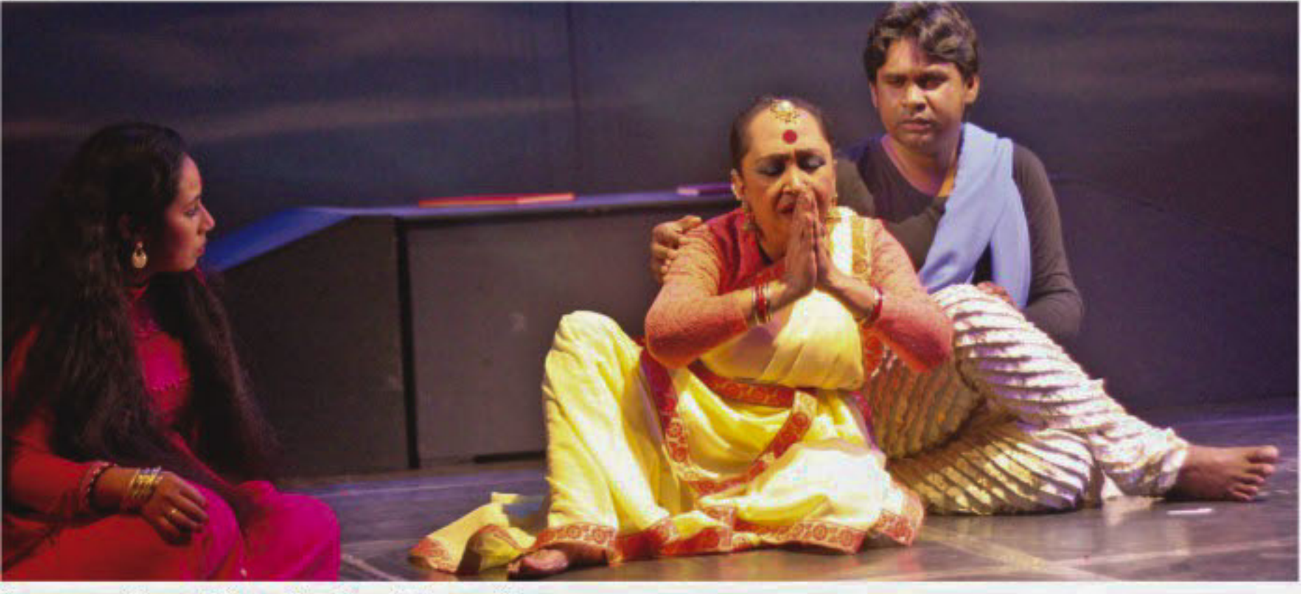
A scene from "Amrita Upakkhyan"