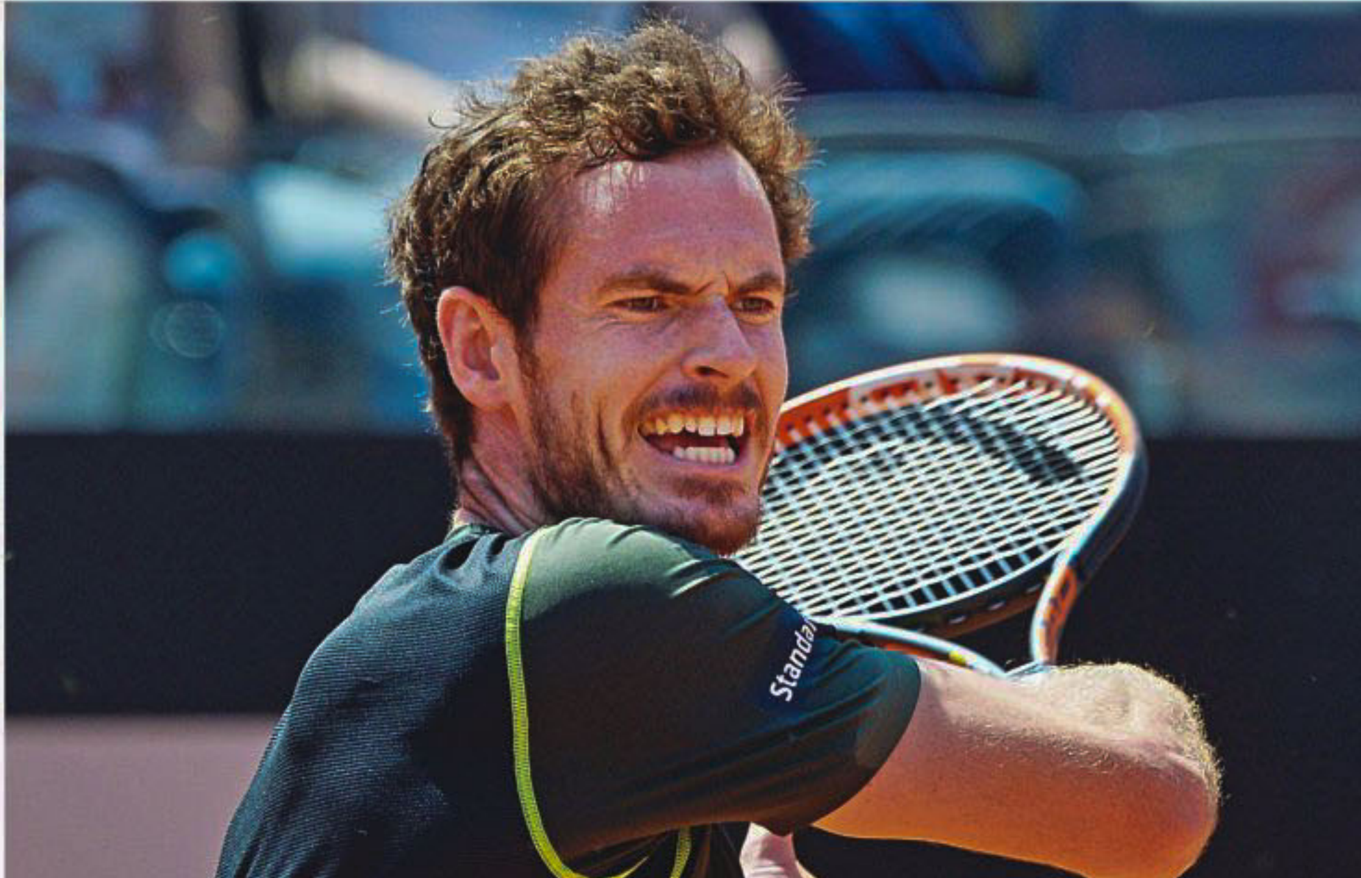
Briton Andy Murray plays a backhand return against Jeremy Chardy of France during the second round of Italian Open in Rome yesterday.

However, Pietersen did make light of the situation, joking on Twitter that he had applied for the England coaching job as England are currently without a coach following the dismissal of Peter Moores last weekend.