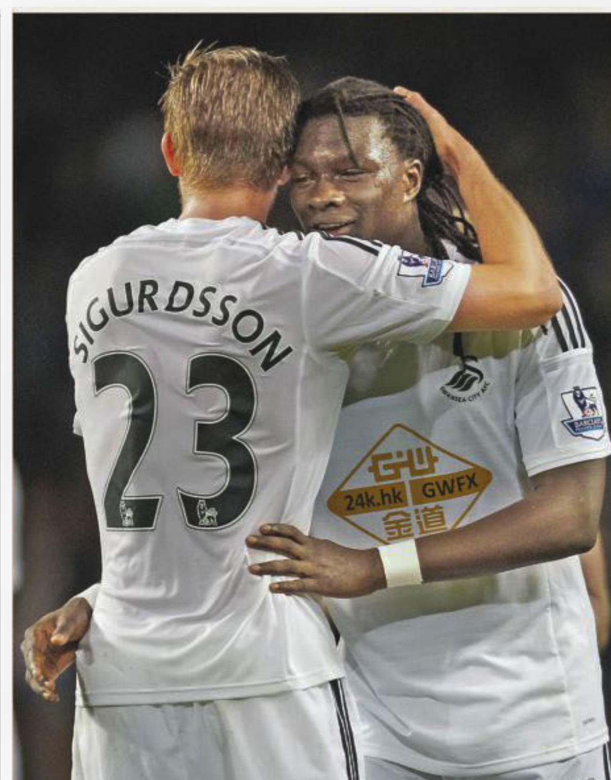
Bafatemi Gomis celebrates his goal against Arsenal at the Emirates Stadium yesterday.