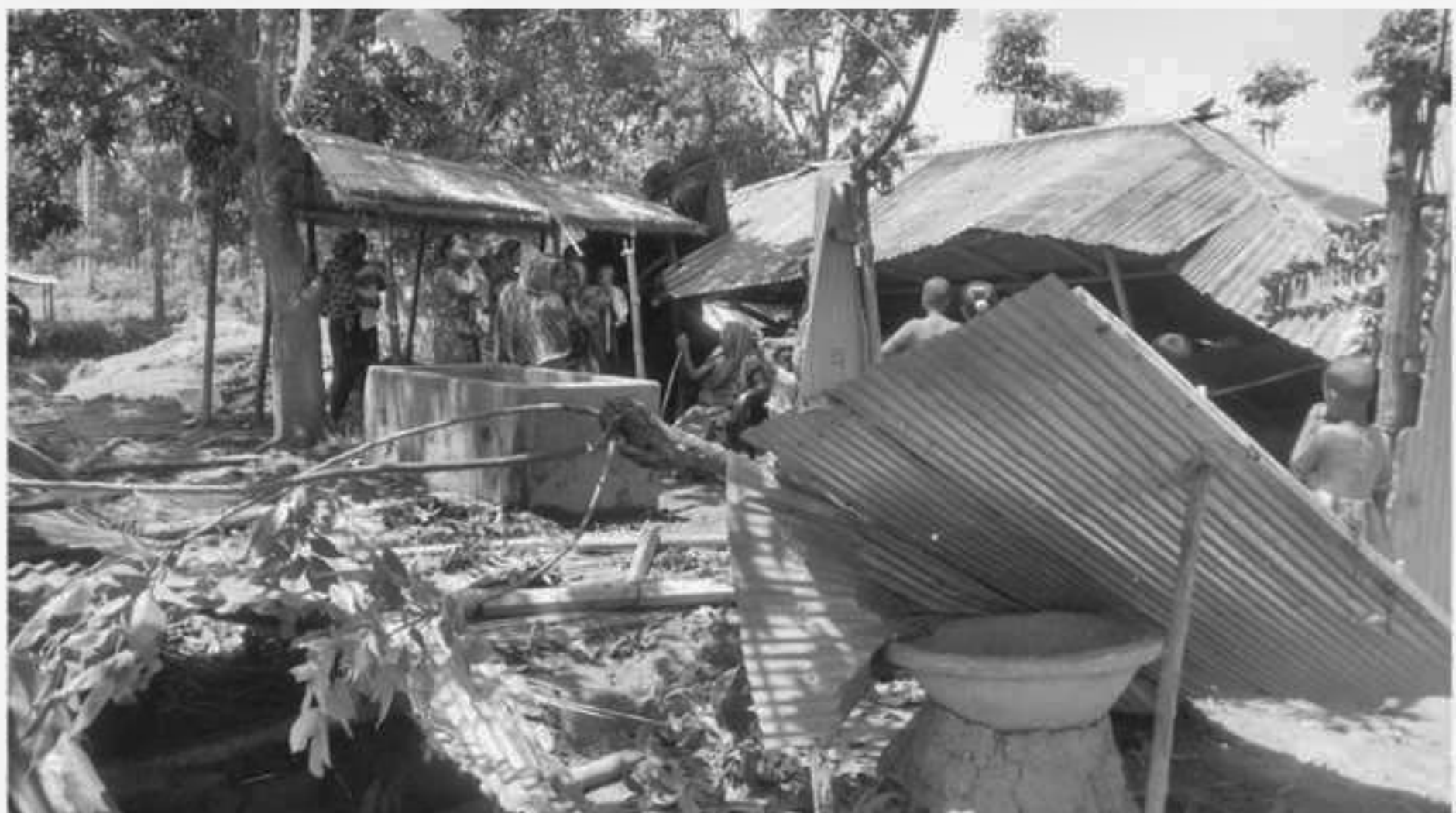
Corrugated iron sheets blown off a nearby house get stuck in a tree beside Zanria College at Manikganj municipality, and below, a house at Matigachha village in Atghoria upazila under Pabna district lies ravaged as nor'wester hit different districts of the country yesterday.