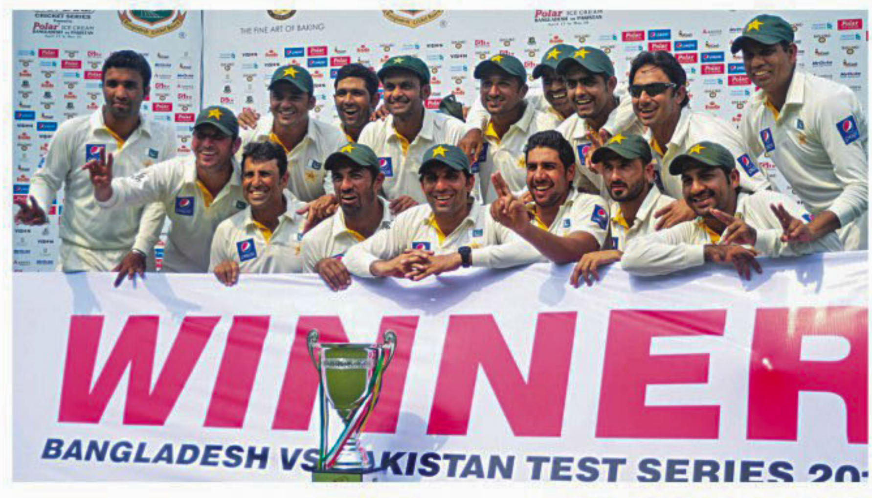
Finally, there was something to cheer for Pakistan. Here they celebrate after their 1-0 Test series win yesterday at Mirpur, where they suffered a 3-0 ODI whitewash and a T20 defeat.