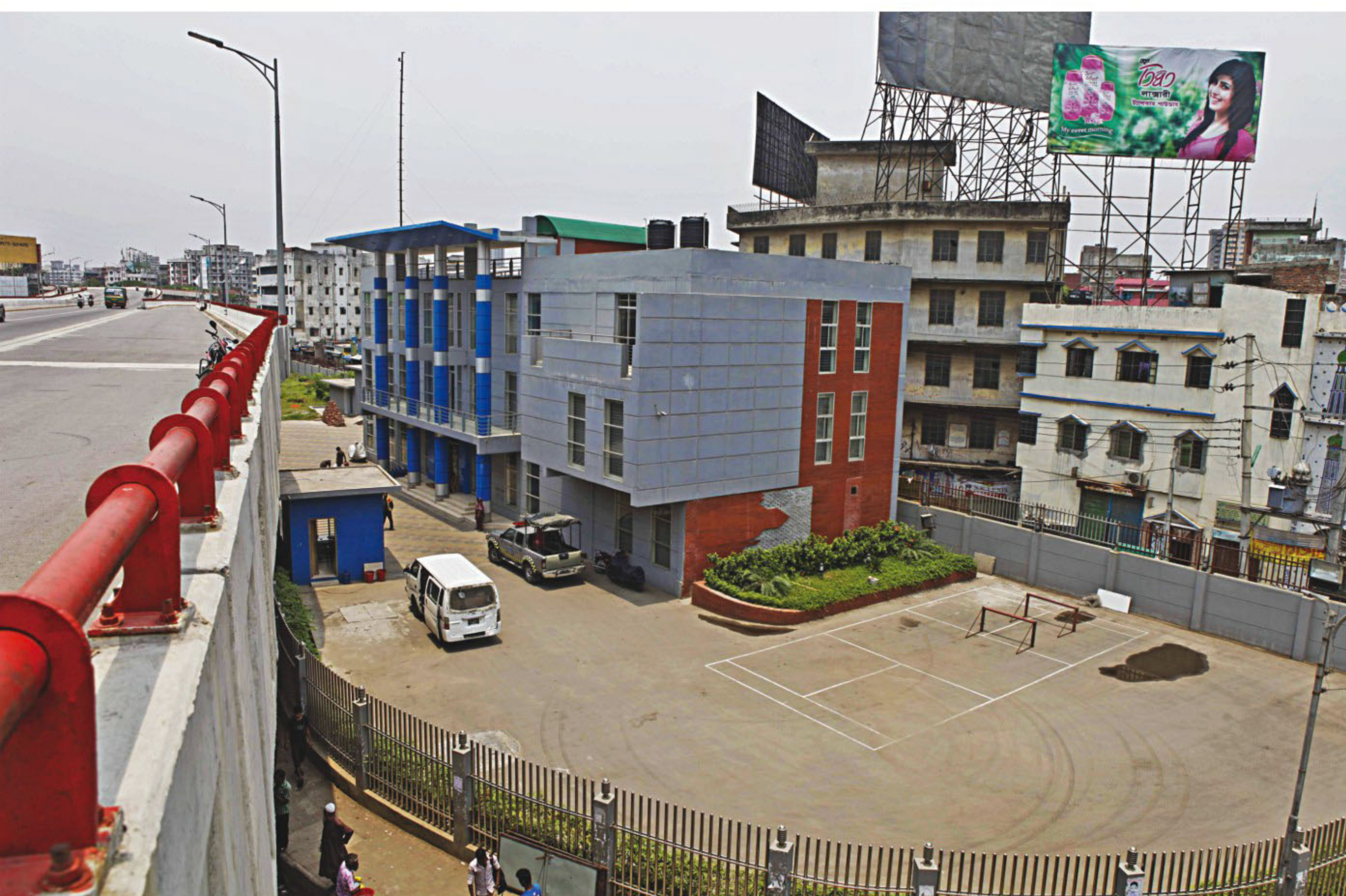
The office building of Orion Group, the firm that is constructing Mayor Mohammad Hanif Flyover, stands on a compound earlier known as Sayedabad Park. The Dhaka city corporation let the firm use the parkland "temporarily" till the construction of the flyover is complete. The photo was taken this week.