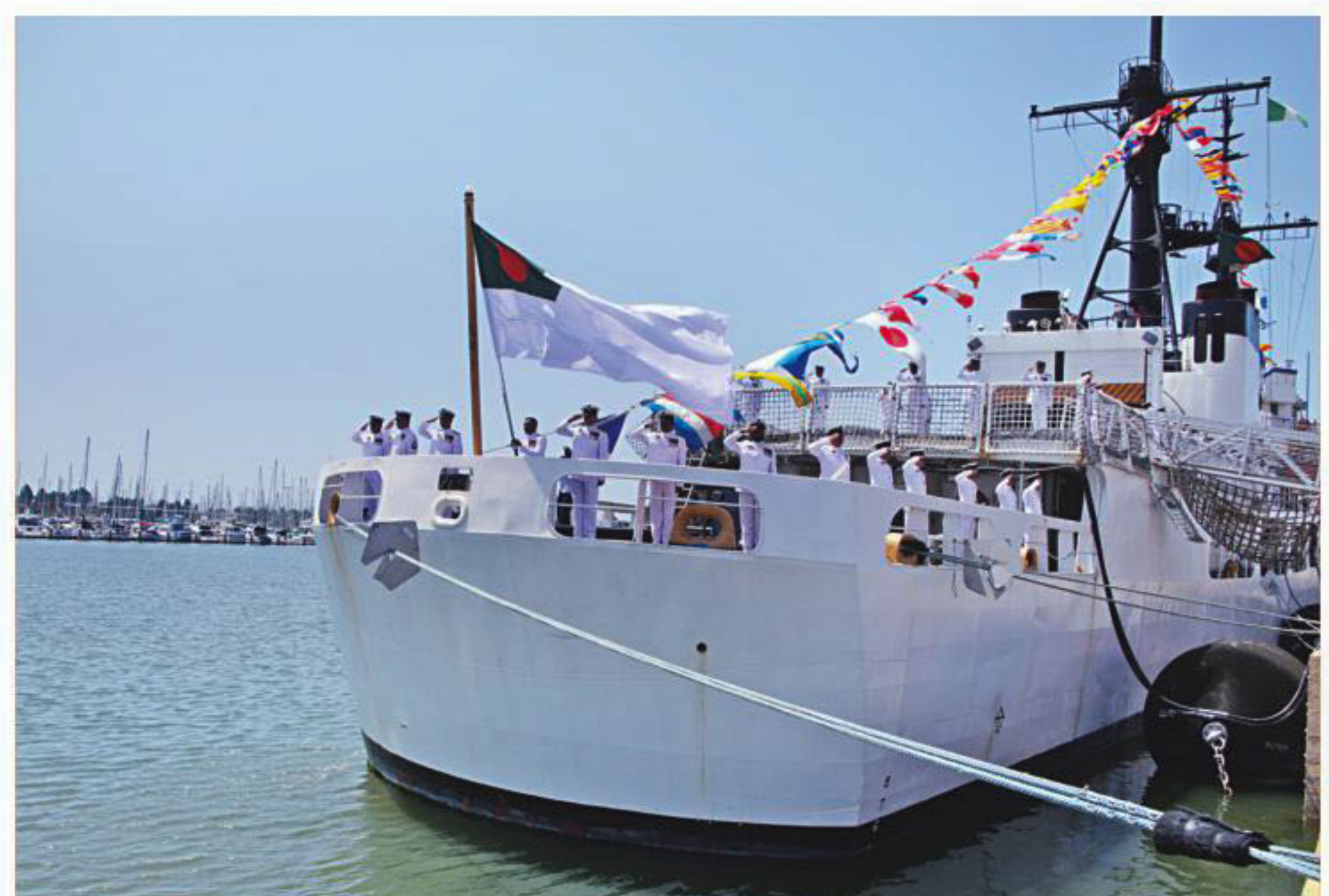
US Coast Guard handed over a cutter, "Rush", to Bangladesh Navy as "BNS Somudra Avijan" in Alameda, California on Wednesday. At 378 feet, the ship will arrive in Bangladesh later this year. Two years ago, the US transferred another cutter, which joined the navy's fleet as BNS Somudra Joy, to help Bangladesh enhance its maritime capability.

FROM PAGE 4 review of yesterday's order. According to a circular of primary and mass education ministry in 2010, recruitment of assistant teachers to the then registered non-government primary schools was supposed to be made from upazila-based panels of selected candidates. But as per the primary and mass education board's decision of 2012, around 14,000 candidates were appointed from union-based panels of selected candidates at different times. Ten candidates, who were deprived of jobs due to decision, from Naogaon filed a writ petition with the HC challenging the legality of the decision and seeking its order for appointing them. The SC yesterday dismissed the government's appeal against the HC order of June 18.