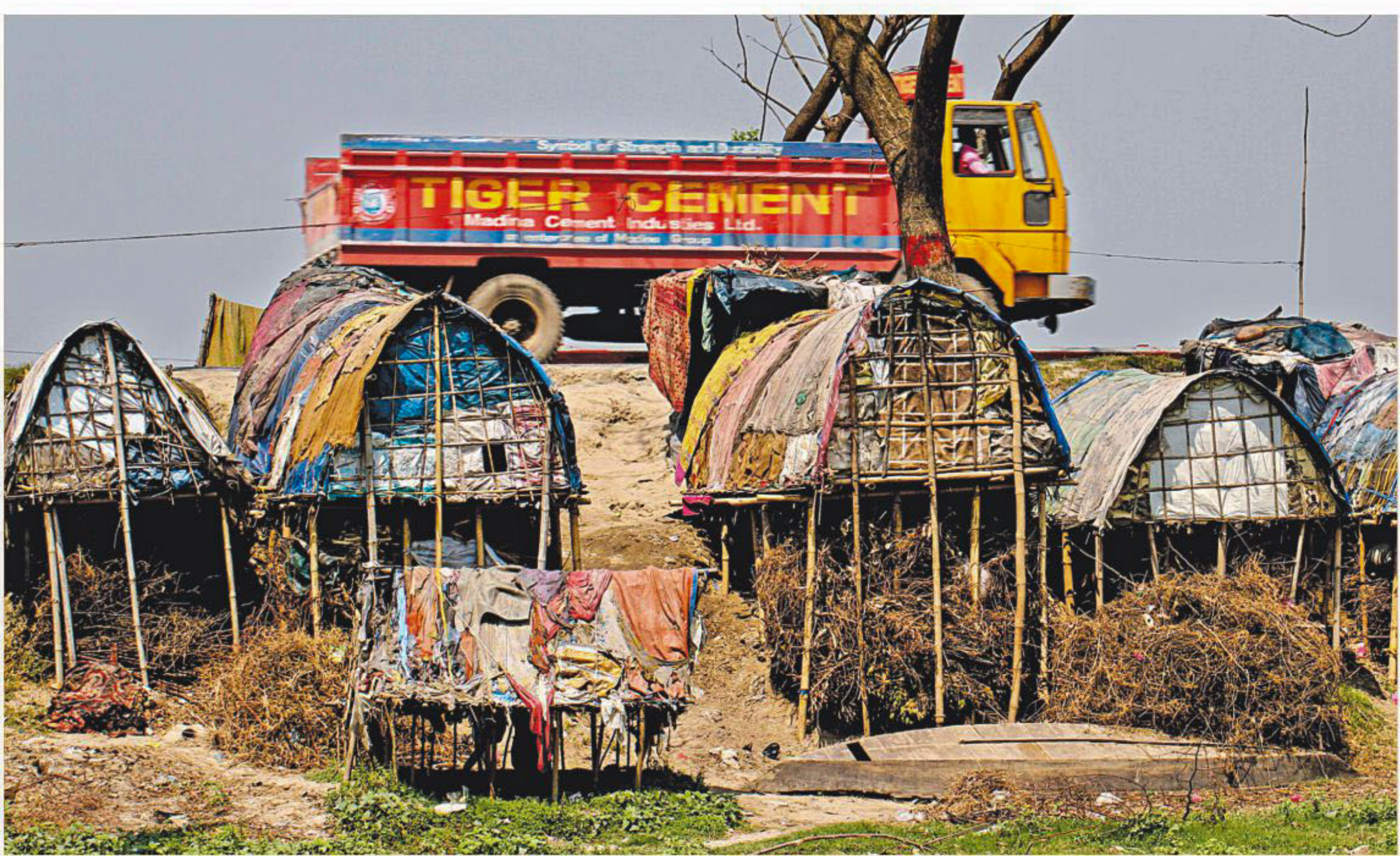
These small shacks propped up by bamboos dot the sides of Dhaka-Mawa highway. They have grown over the past several years. Hit by grinding poverty, people from the country's north stay there and work as farmworkers in nearby areas from February to May, when potato and boro rice are cultivated and harvested, before going back to their permanent homes. The photo was taken this week.