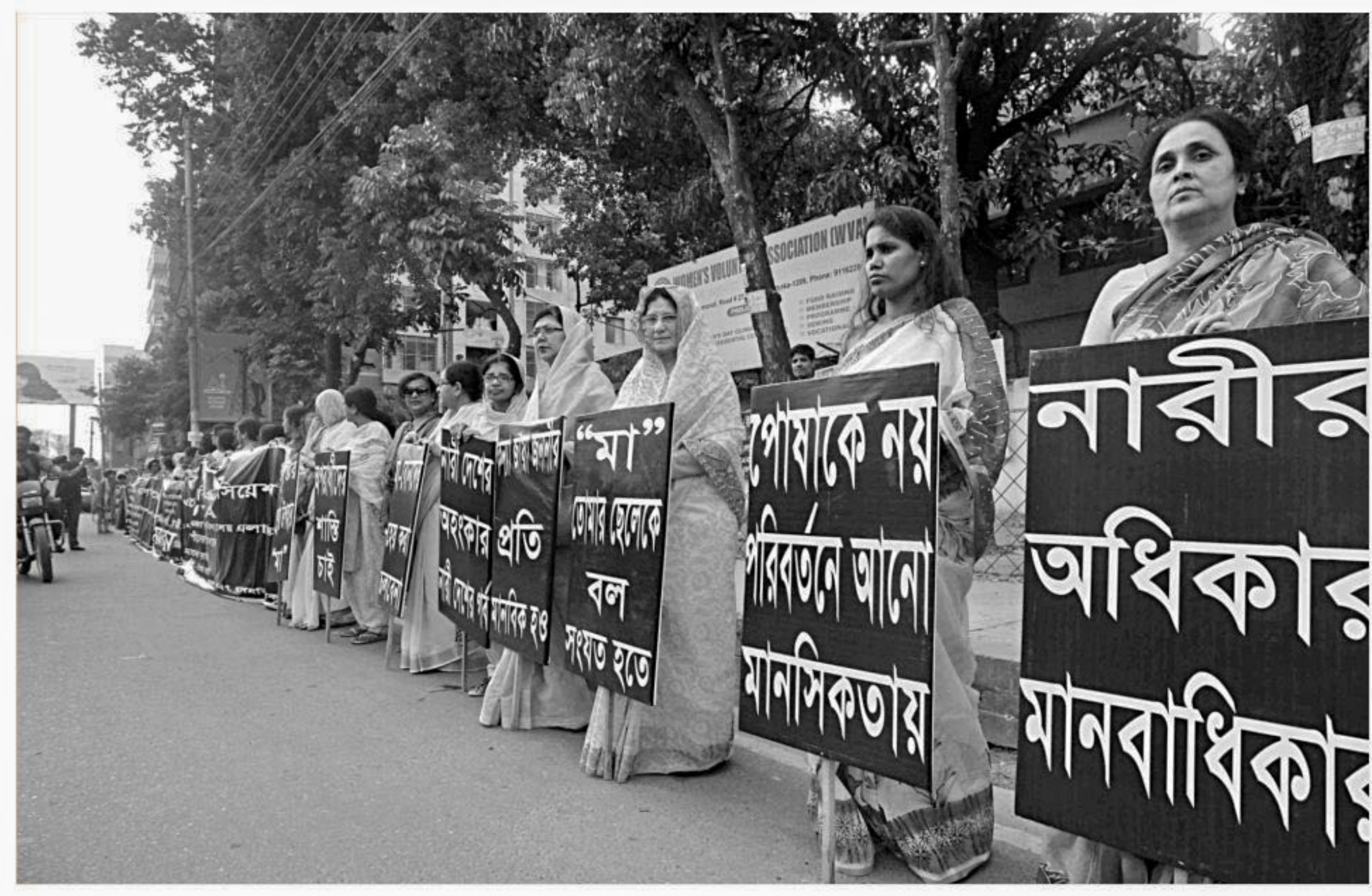
Protesting the mass molestation of females on Pahela Baishakh, Women's Voluntary Association (WVA) forms a human chain in front of its office in the capital yesterday.