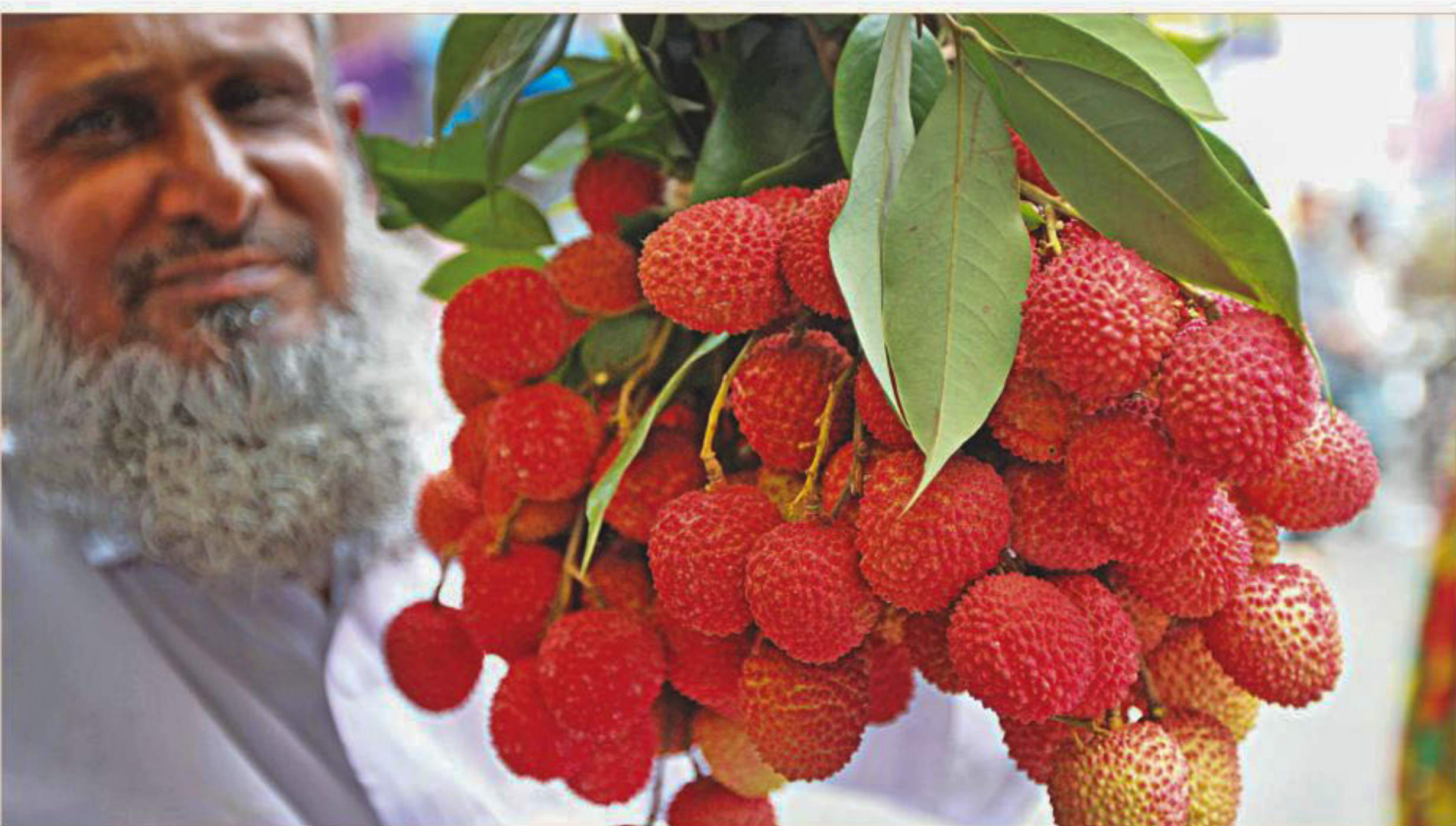
Litchis, one of the much-awaited summer fruits, have hit the market in the capital. In this photo taken on Wednesday, a vendor sits near Baitul Mukarram Mosque with the fruit, bought from producers in Sonargaon of Naryanganj. He was selling a hundred litchis at Tk 800.