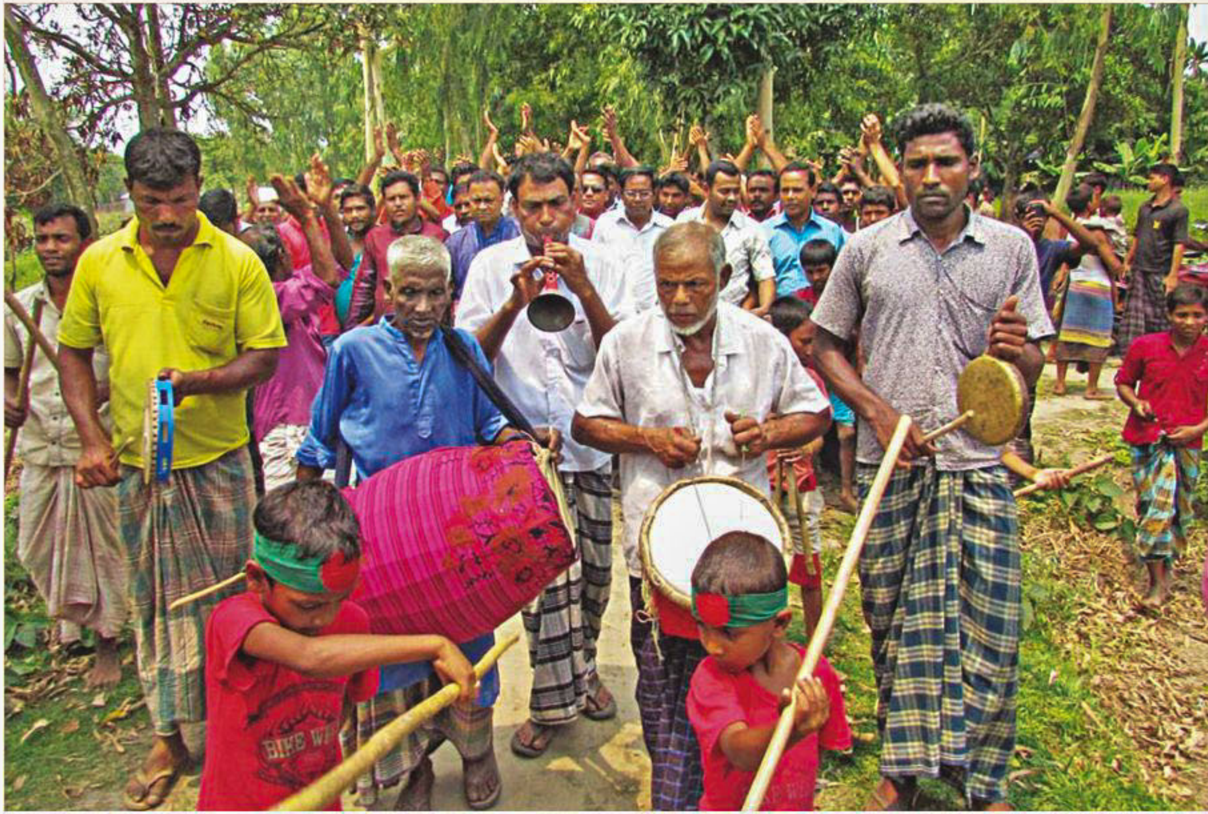
People of Garati enclave in Panchagarh Sadar upazila march in a joyful procession to the accompaniment of music and traditional Lathi Khela hailing the passage of LBA amendment bill in Indian parliament.