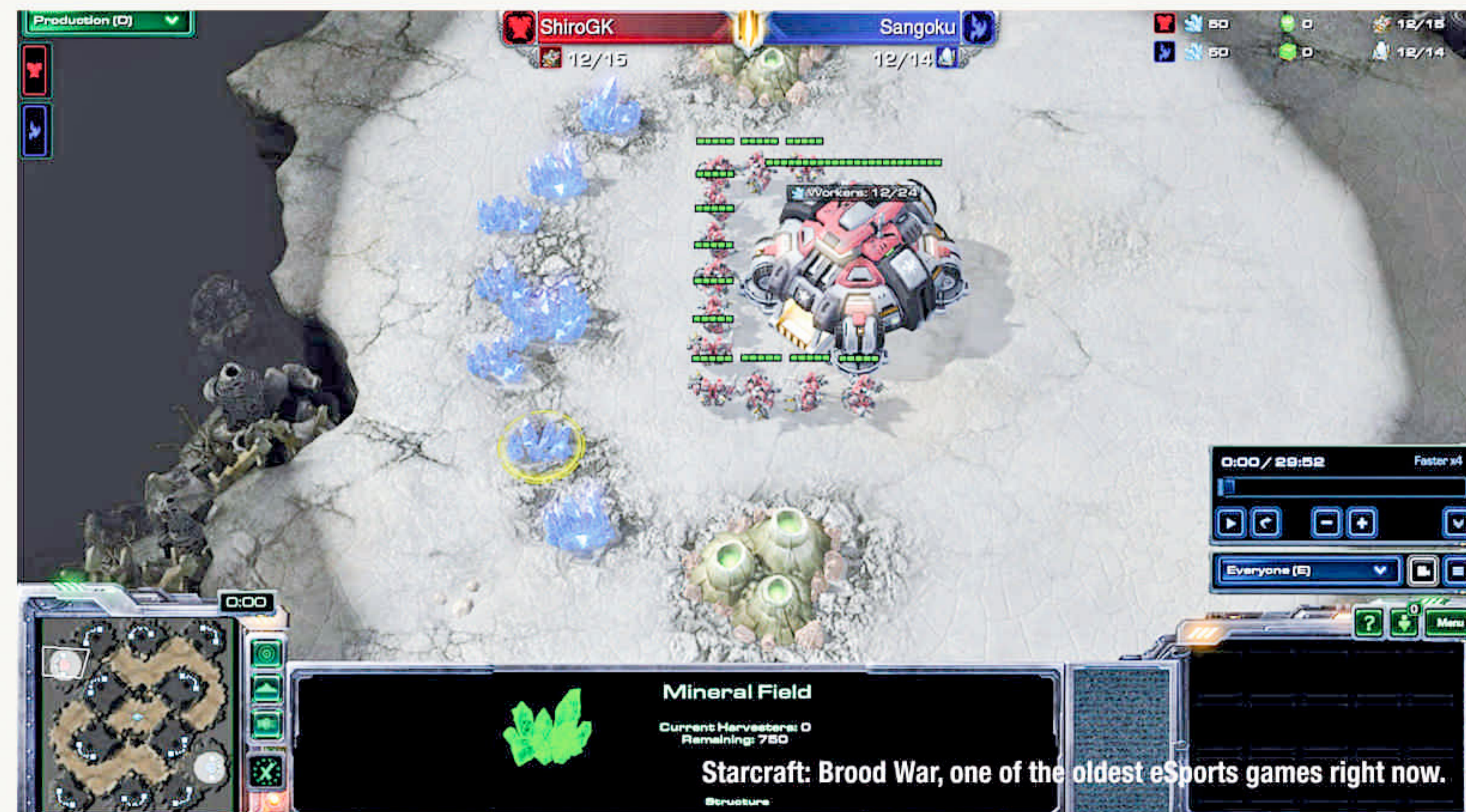
Mineral Field Current Harvesters: 0 Remaining: 750 Starcraft: Brood War, one of the oldest eSports games right now.

1. CHOOSING THE RIGHT GAME: Now, the first step into the world of eSports requires you to choose a game that is played competitively on a moderate to large scale both locally and internationally. To begin you must first consider your taste in video games, evaluate your preference and, finally, make a choice based on your preference. This will help you choose a game that will make the transition phase of going pro from a noob much easier, as you will be more than happy to give enough effort to get better at a game you love playing. Also, try to bring your preferences in congruence with what your friends are playing. While it is entirely possible to get good at a game by yourself, it is much more enjoyable to play and improve at a game with your friends.