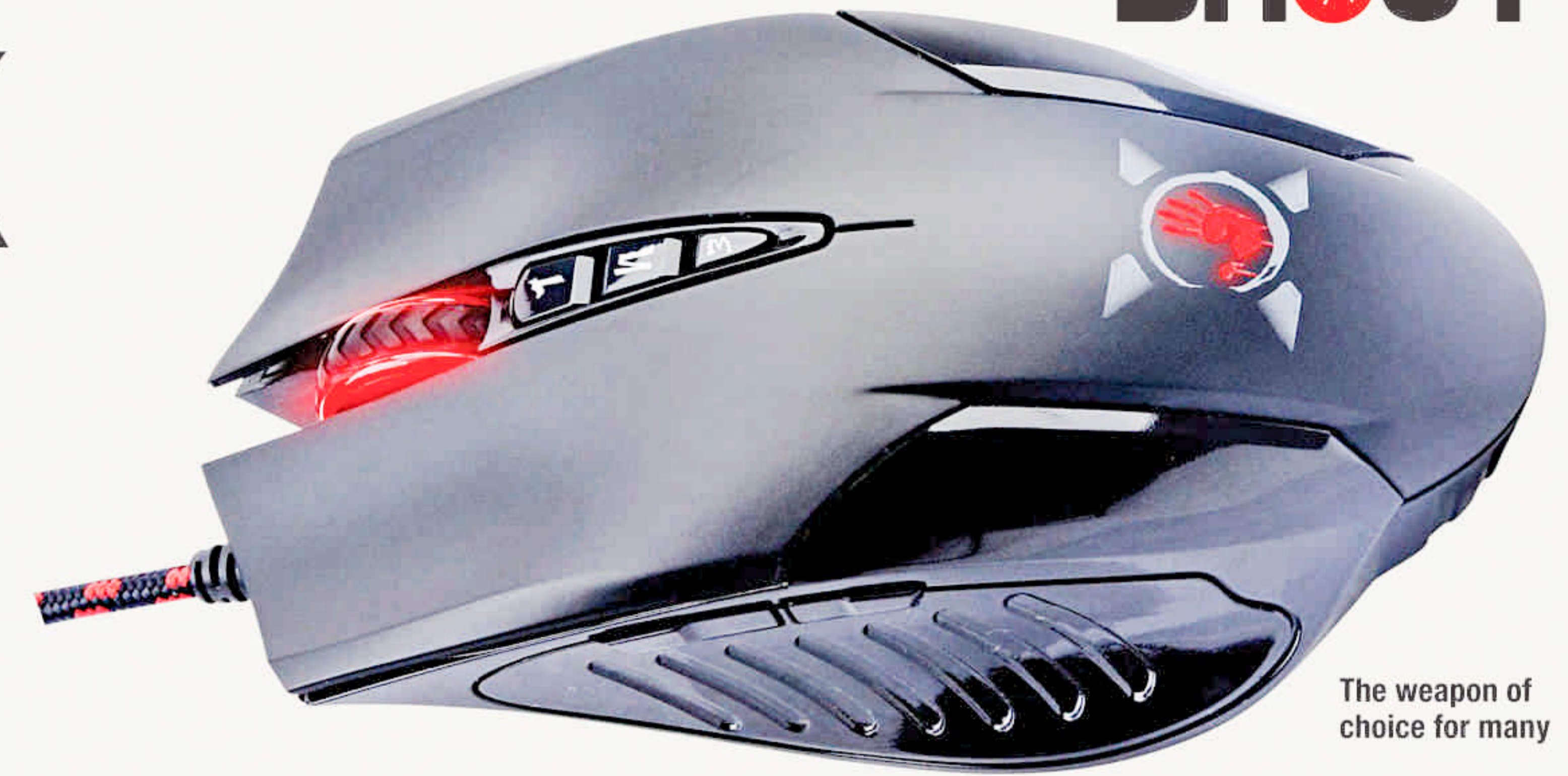
The weapon of choice for many

As applicable for many sporting activities, in order to turn yourself into a true eSports athlete you must equip yourself with the right gear. Not only that, you must ensure that they properly cater to your needs based on the game you are playing; which brings us to our first point: