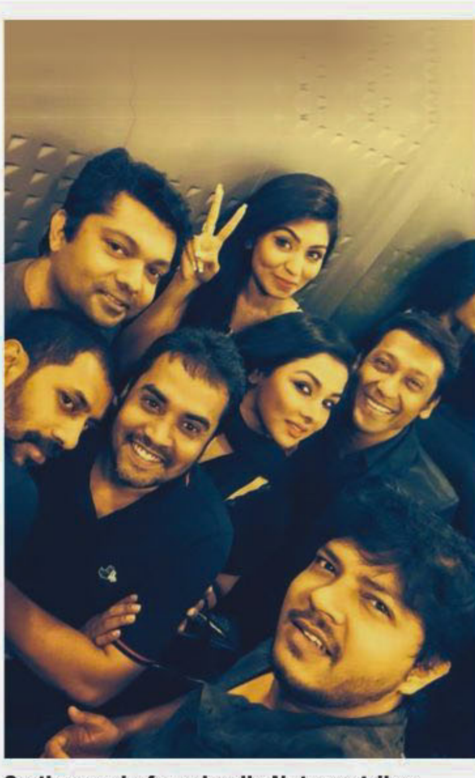
On the eve before deadly Nature strikes

given a red alert in the city for citizens and tourists to stay out of their homes and hotels. The worst part came at nightfall; it rained incessantly and the temperature plunged. With the combination of lights out and cold, there was a fear of death. It was a sleepless night for all of us. The tremors were continuously going on. And we had nothing but to pray to the Almighty to save our life." "I don't know how I stayed out in the cold with pain in my arm and ankle. I was thankful to the Bangladesh High Commission because we could later take shelter there. We couldn't even return to our country immediately as the airport was closed." "I thought it was the end for all of us. The death toll was increasing and the tremors showed no mercy, and kept on showing their rage. The last call that I made was to my sister, (as I couldn't reach my husband), from there and told her to take care of my five year-old daughter."