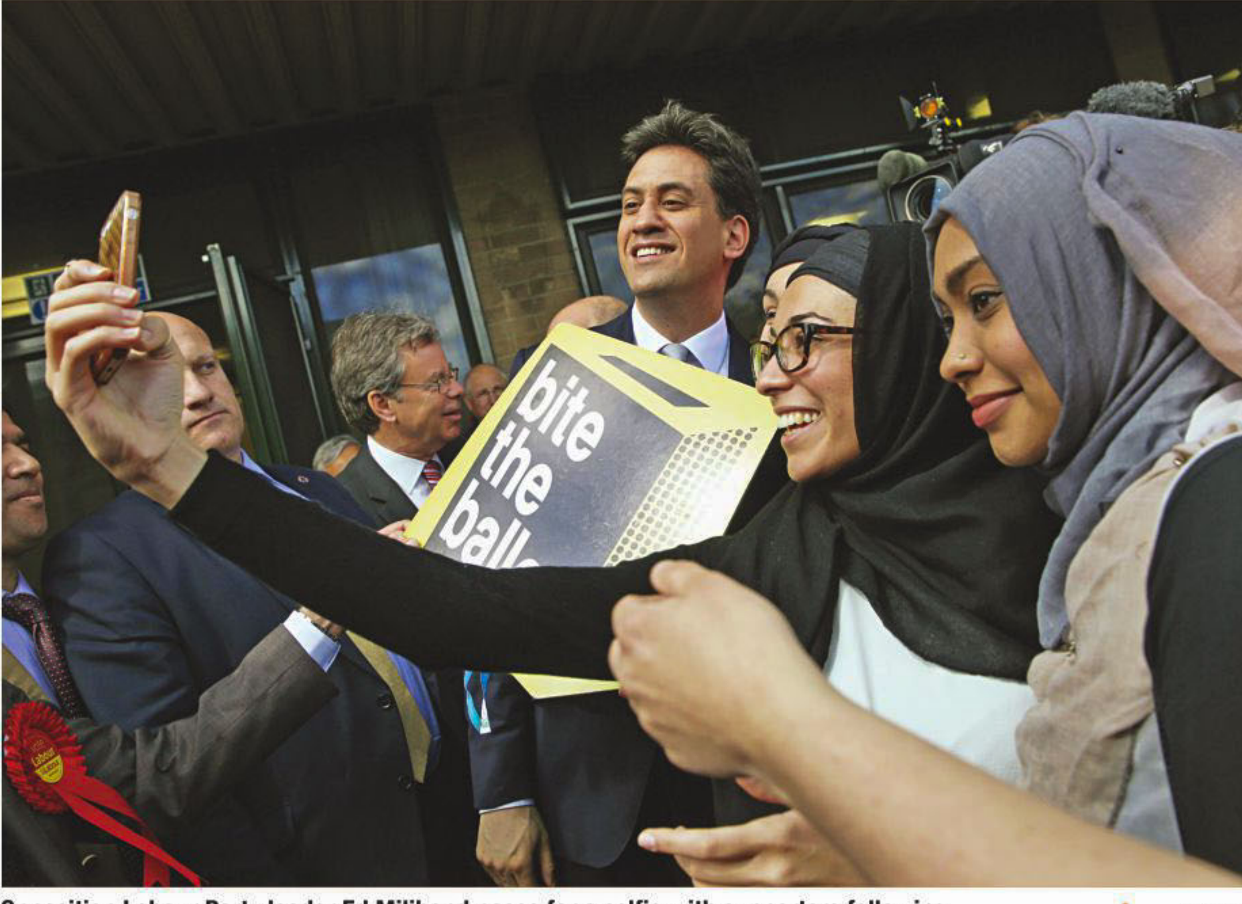
Opposition Labour Party leader Ed Miliband poses for a selfie with supporters following a campaign event in Kempston near Bedford yesterday.