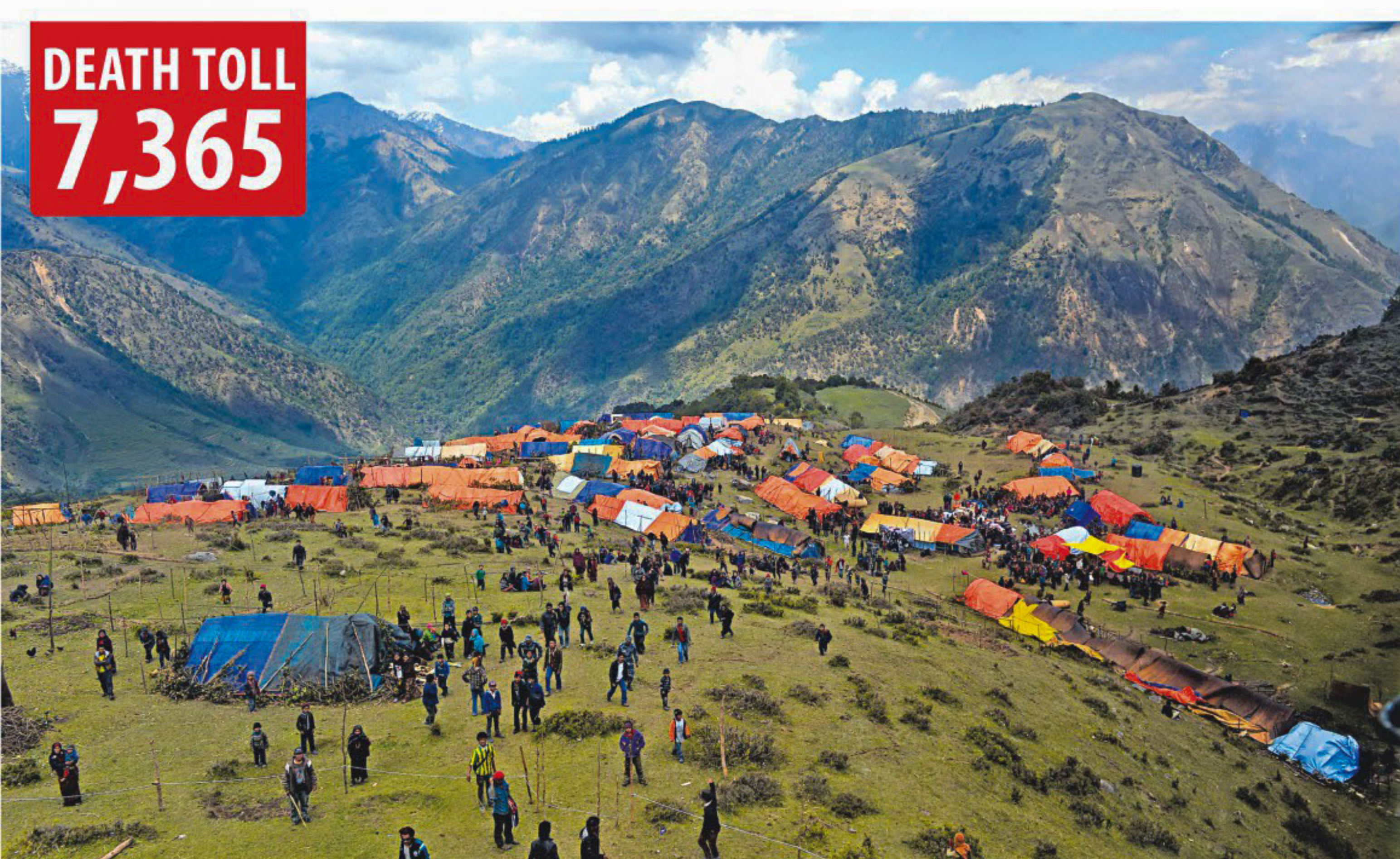
Nepalese villagers walk near their makeshift tents at Laprak village in Gorkha district yesterday. US transport planes were due to make "an immediate difference" to the aid effort in Nepal yesterday, shuttling supplies and rescue teams to remote areas devastated by an earthquake that killed more than 7,300 people.