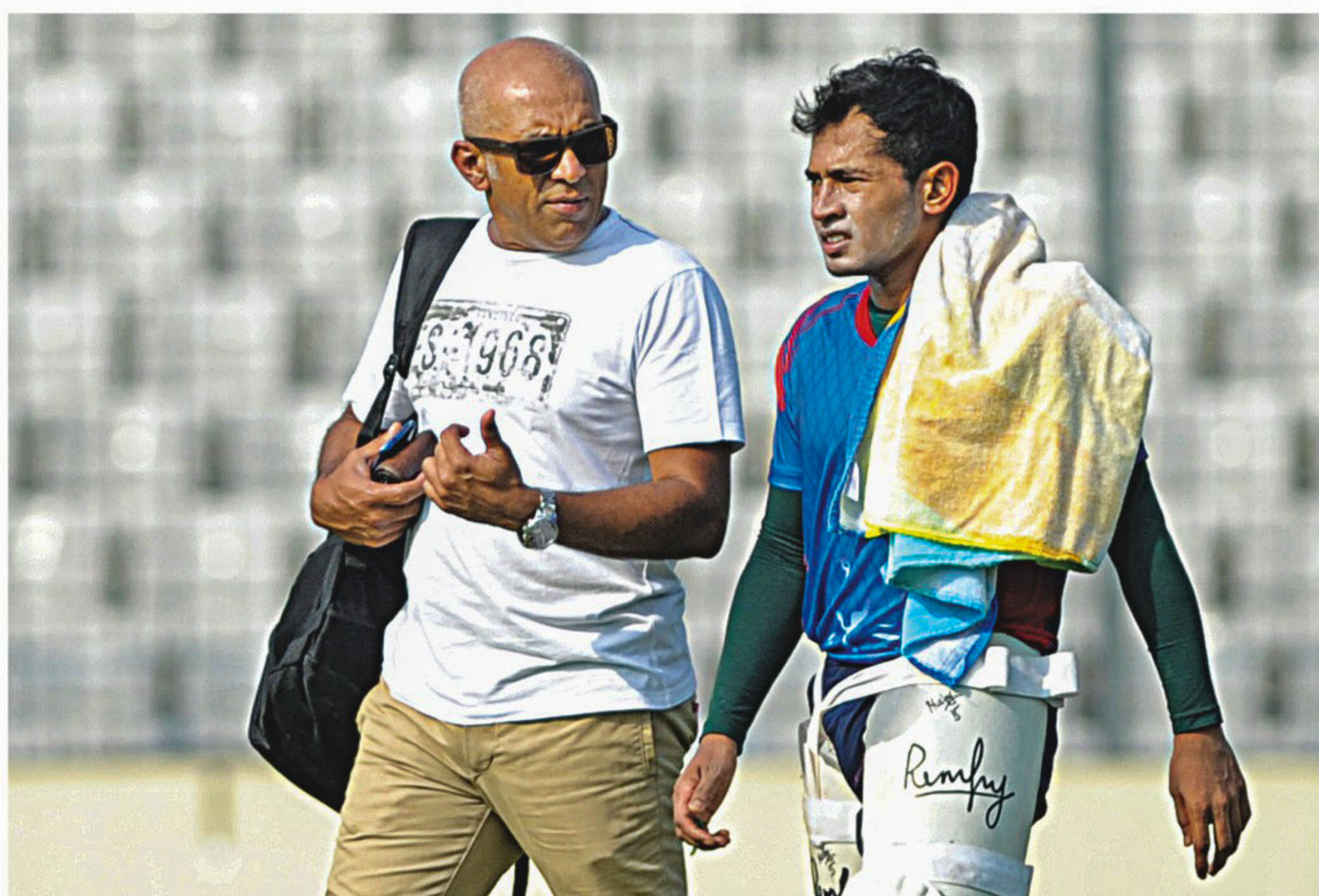
Bangladesh captain Mushfiqur Rahim (R) and coach Chandika Hathurusingha discuss strategy yesterday for the second Test against Pakistan that starts at the Sher-e-Bangla National Stadium in Mirpur tomorrow. Story on page 14.