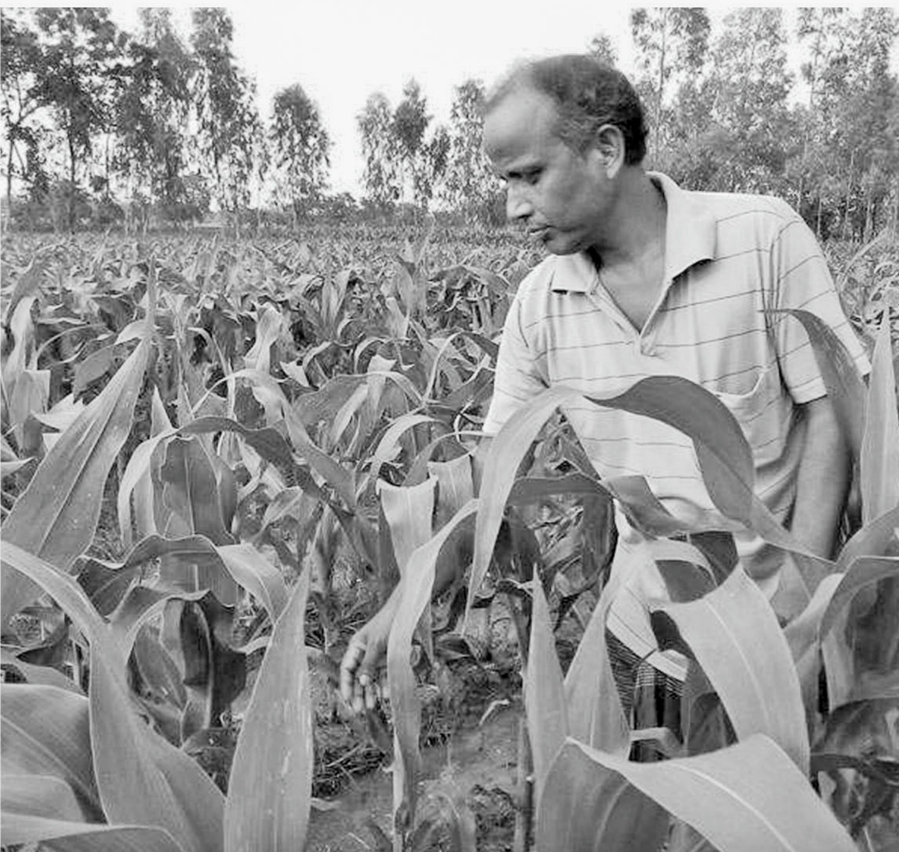
A farmer tends his maize field at Dighaltari village in Aditmari upazila under Lalmonirhat district.