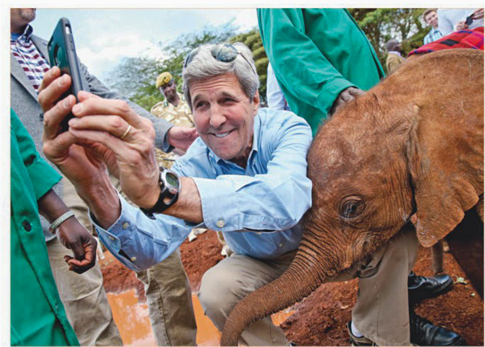
US Secretary of State John Kerry takes a selfie with a baby elephant while touring the Sheldrick Center Elephant Orphanage at the Nairobi National Park in Nairobi. Kerry held talks with Kenyan President Uhuru Kenyatta yesterday on security cooperation, after calling for unity in the face of terror attacks.

Baltimore lifted a curfew Sunday that was imposed across the US East Coast city following widespread riots, as thousands of National Guard troops began to pull out. Mayor Stephanie Rawlings-Blake had faced growing calls for the curfew to be scrapped, particularly from store and restaurant owners who said the 10:00pm to 5:00am nightly restriction was wrecking business. "My goal has always been to not have the curfew in place a single day longer than was necessary," Rawlings-Blake wrote on Twitter. "I believe we have reached that point today." Hundreds of people meanwhile rallied again at City Hall plaza, summoned by local religious leaders. Across the city, people cheered the return to relative calm with impromptu celebrations, a far cry from the riots that saw angry protesters torch cars, pelt police with stones and ransack stores on April 27. The riots stemmed from protests over the death of Freddie Gray, 25, who suffered a serious spinal injury while in the back of a police van on April 12. He died a week later. A total of 113 officers were wounded and 486 protesters were arrested. About 200 businesses, most minority-owned, were lost in the rioting on April 27, according to Hogan. Six Baltimore police officers, three white and three black, were charged Friday with multiple counts, including second-degree murder and manslaughter in connection with the death.