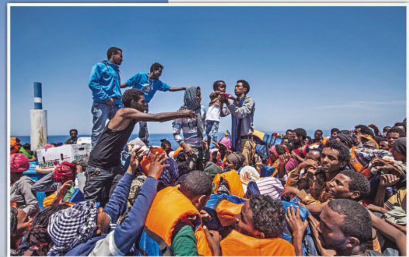
This handout picture taken on May 3, 2015 released by the MOAS (Migrant Offshore Aid Station) shows migrants aboard a wooden boat on the Mediterranean sea. Inset, Migrants wait aboard a wooden boat during a rescue operation off the coast of Sicily in the Mediterranean sea. Another 5,800 migrants desperate to reach Europe were rescued this weekend as they tried to cross the Mediterranean on rickety boats, more than 2,150 of them on Sunday, the Italian coastguard said.