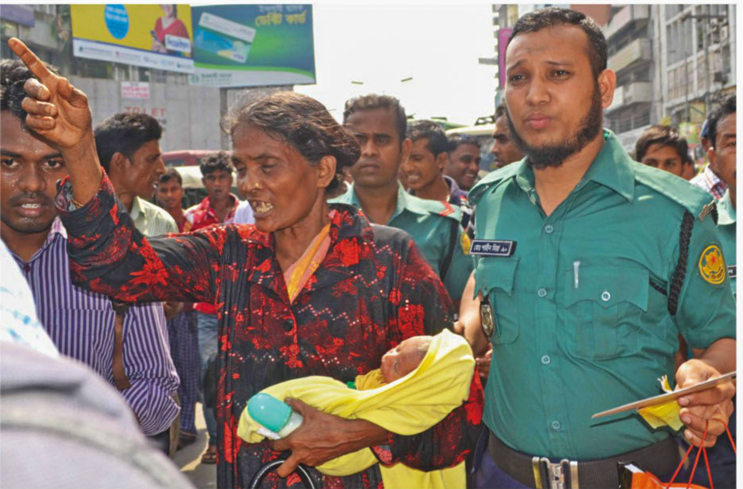
A police officer detains a woman who bought the day-old baby in her arms from his mother for Tk 20,000 in Paltan of the capital yesterday.