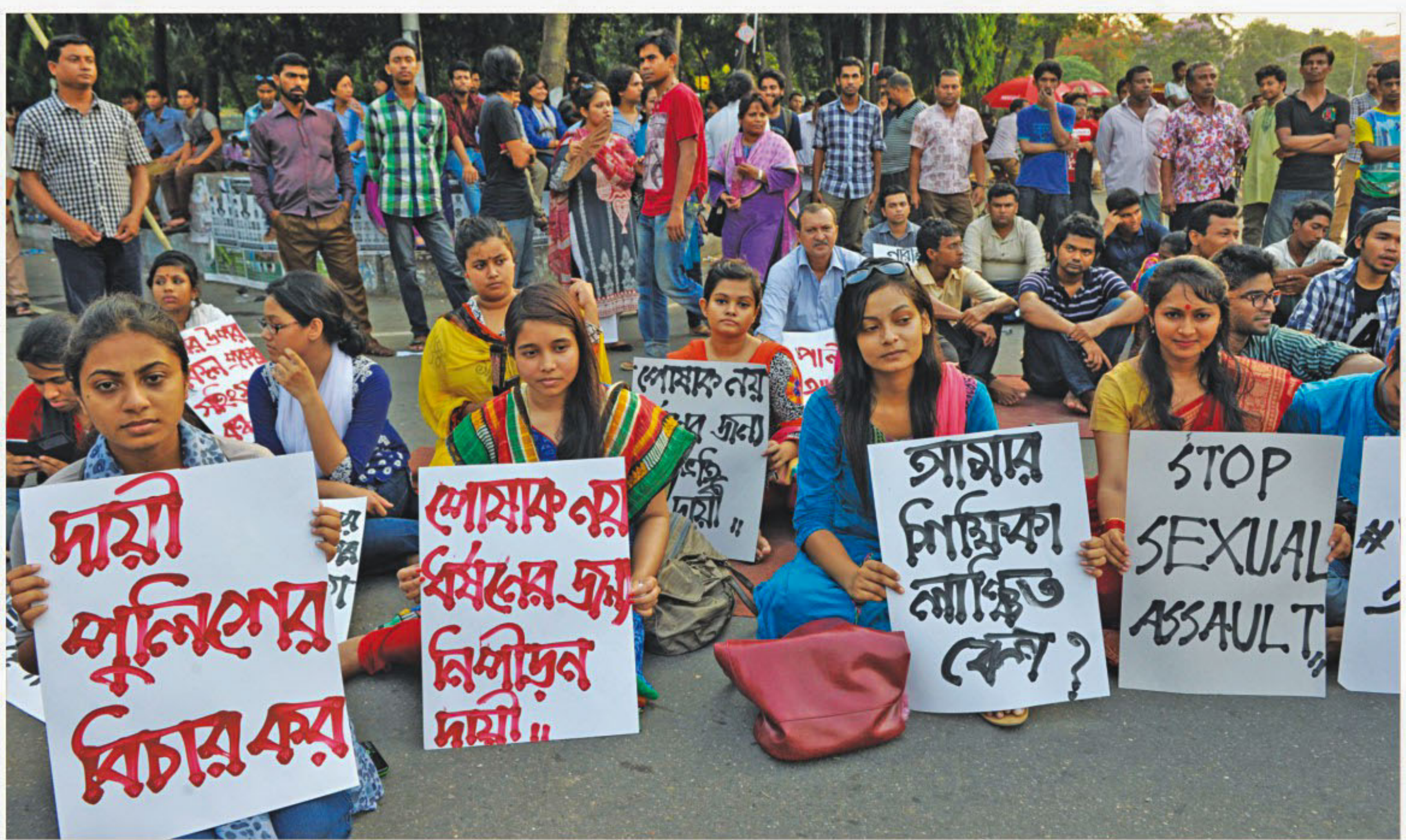
Protesters join a rally of Bangladesh Chhatra Union near TSC of Dhaka University yesterday with a six-point demand including resignation of the proctor and punishment for the cops who did not take action to stop the youths who were molesting females for an hour during the Pahela Baishakh celebrations near the Suhrawardy Udyan gate.

Some 30 to 40 rowdy youths assaulted and sexually harassed around 20 women for about an hour at the Suhrawardy Udyan gate near the TSC on that day.