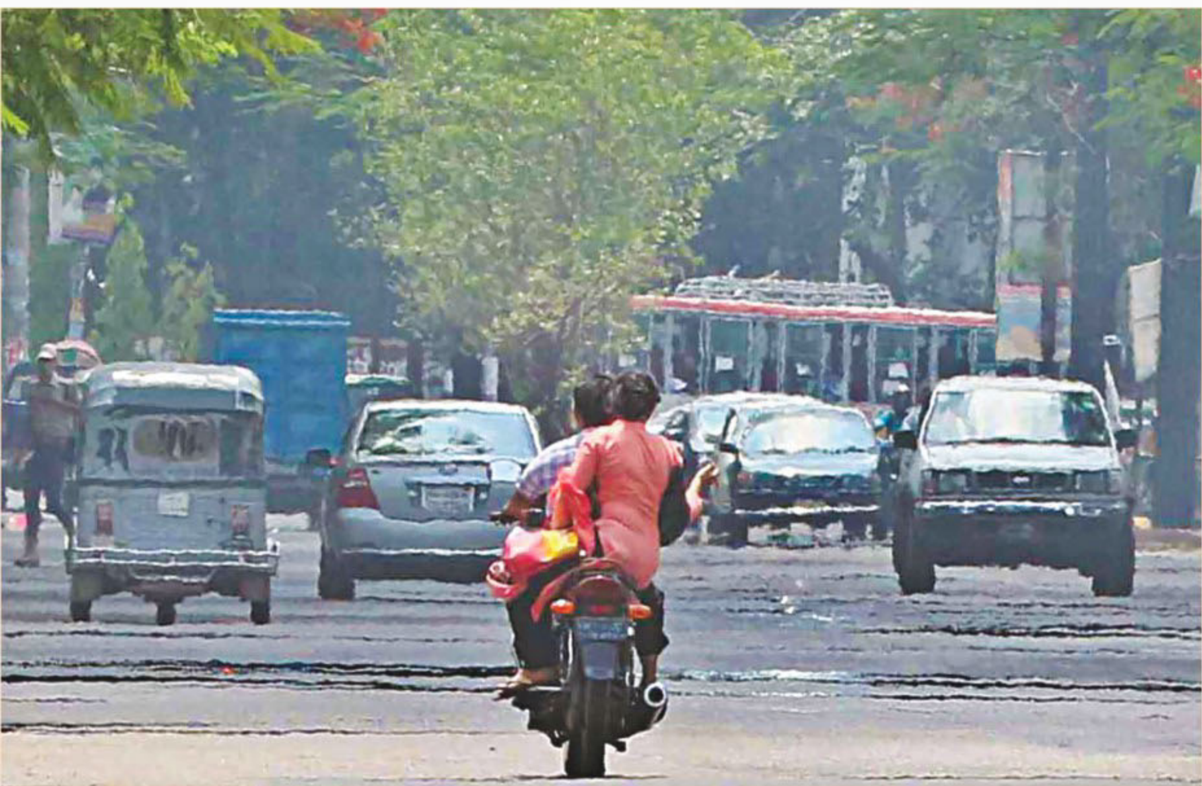
Traffic not as heavy as usual in Dhaka yesterday since many opted to stay indoors amid the heat of the summer. The photo of the heat haze was taken in front of the Crescent Lake.