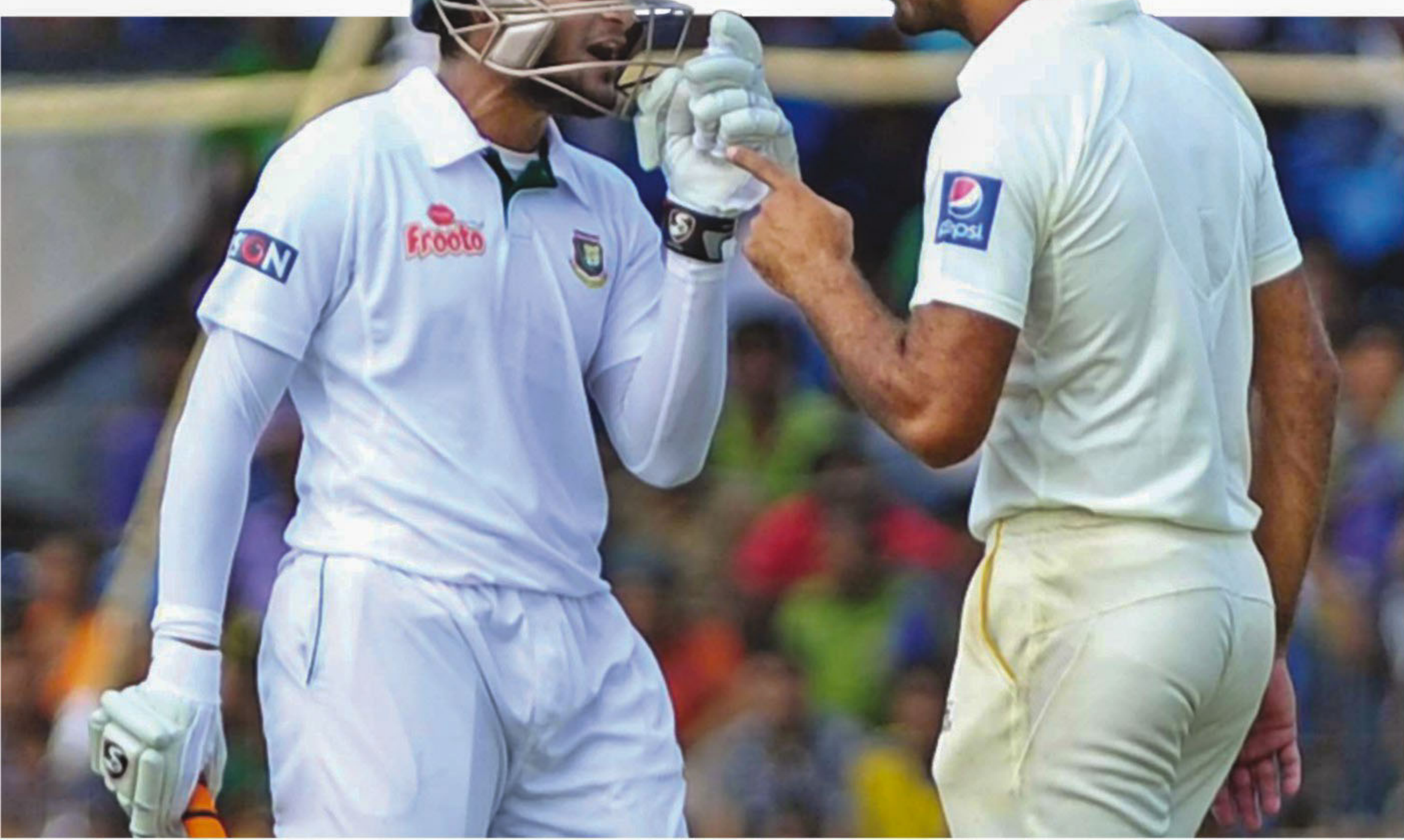
A CHANGE IN ATTITUDE TOO: Tigers superstar Shakib Al Hasan (L) matches Pakistan paceman Wahab Riaz word for word during the absorbing final session of the first Test at Sheikh Abu Naser Stadium in Khulna on Saturday.