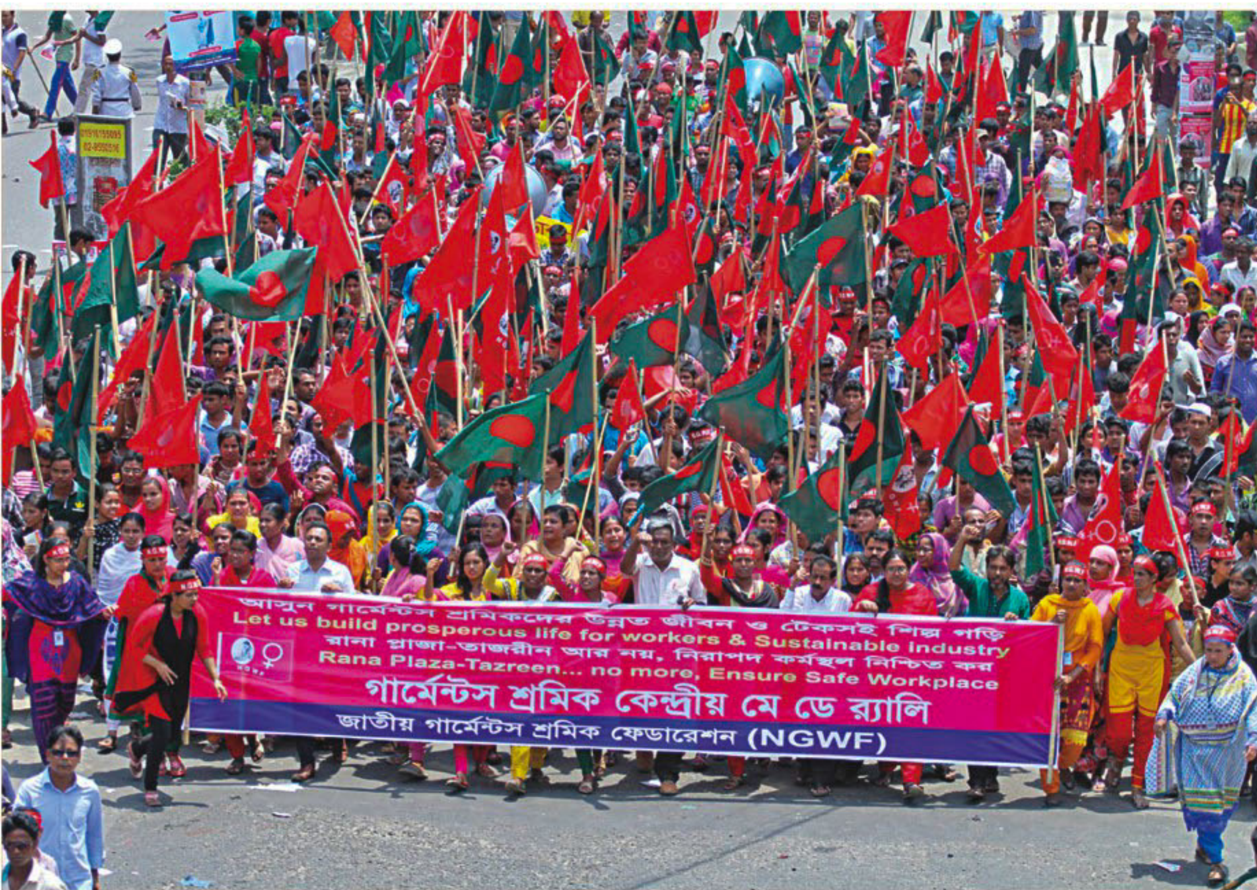
Different garment workers' organisations under the banner of "Jatiya Garments Sramik Federation" bring out a procession in front of Jatiya Press Club in the capital on May Day.