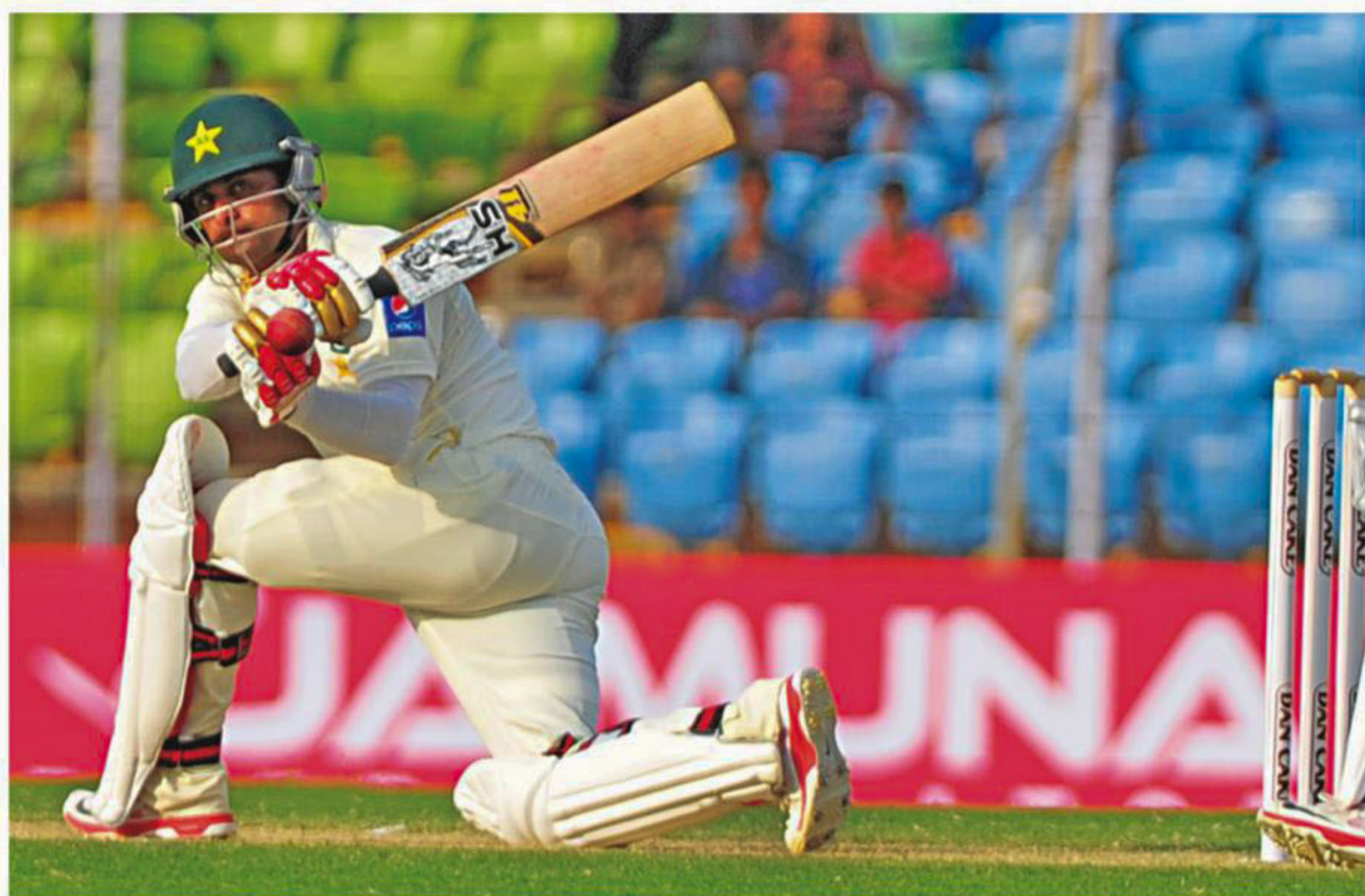
Pakistan opener Mohammad Hafeez sweeps one on his way to scoring 137 runs on the second day of the first Test at the Sheikh Abu Naser Stadium in Khulna yesterday. The opener's unbeaten knock helped the visitors post 227 for one after Bangladesh were dismissed for 332 in their first innings. Stories on pages 14, 15.