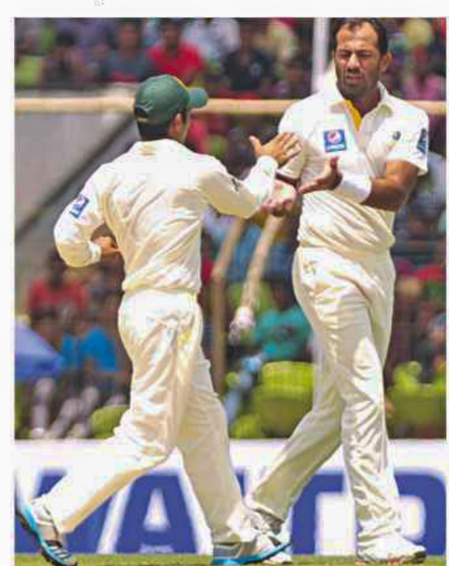
Pakistan bowlers had a field day yesterday, dismissing six Bangladeshis for only 96 runs.