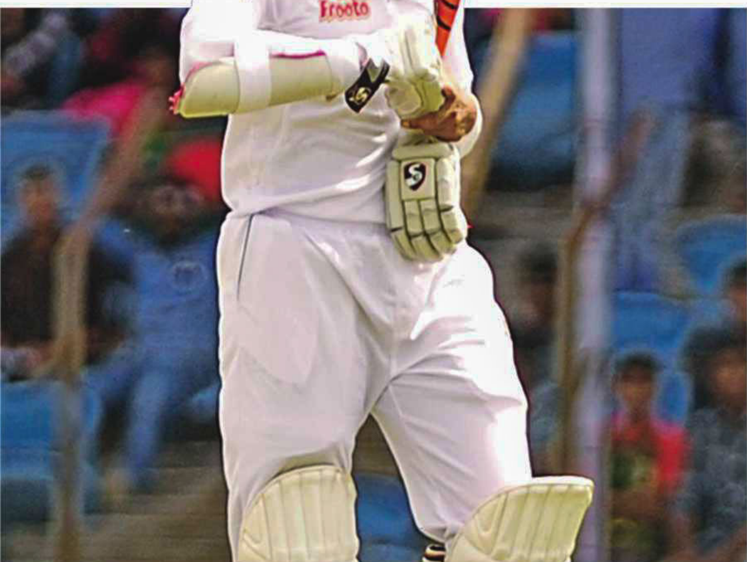
That Bangladesh were bowled out for 332 on a pitch which barely had anything in it for the bowlers, displayed the batsmen's lack of patience. This time there was no saviour; not even Shakib Al Hasan could perform, scoring only 25 runs.