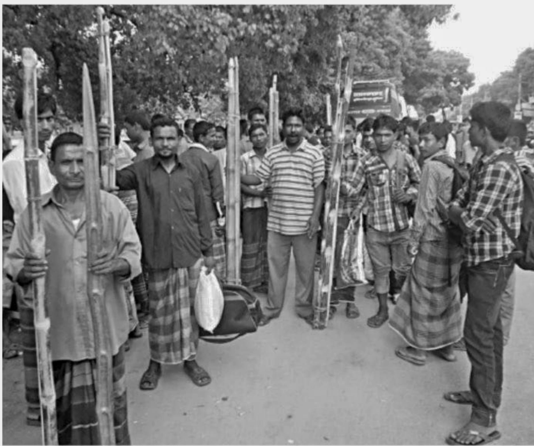
Faced with seasonal unemployment in their areas, a large number of farm labourers among other passengers wait on Banglabandha Road in Thakurgaon town on Thursday, to get buses for going to Dhaka and Comilla districts in search of work there.