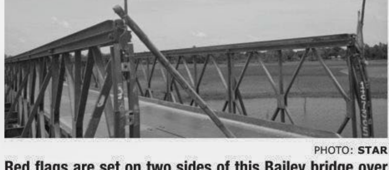
Red flags are set on two sides of this Bailey bridge over Aoliakhana River in Jaldhaka upazila under Nilphamari district as the Roads and Highways Department prohibited movement of heavy vehicles after three steel plates of the bridge floor collapsed on Sunday night.