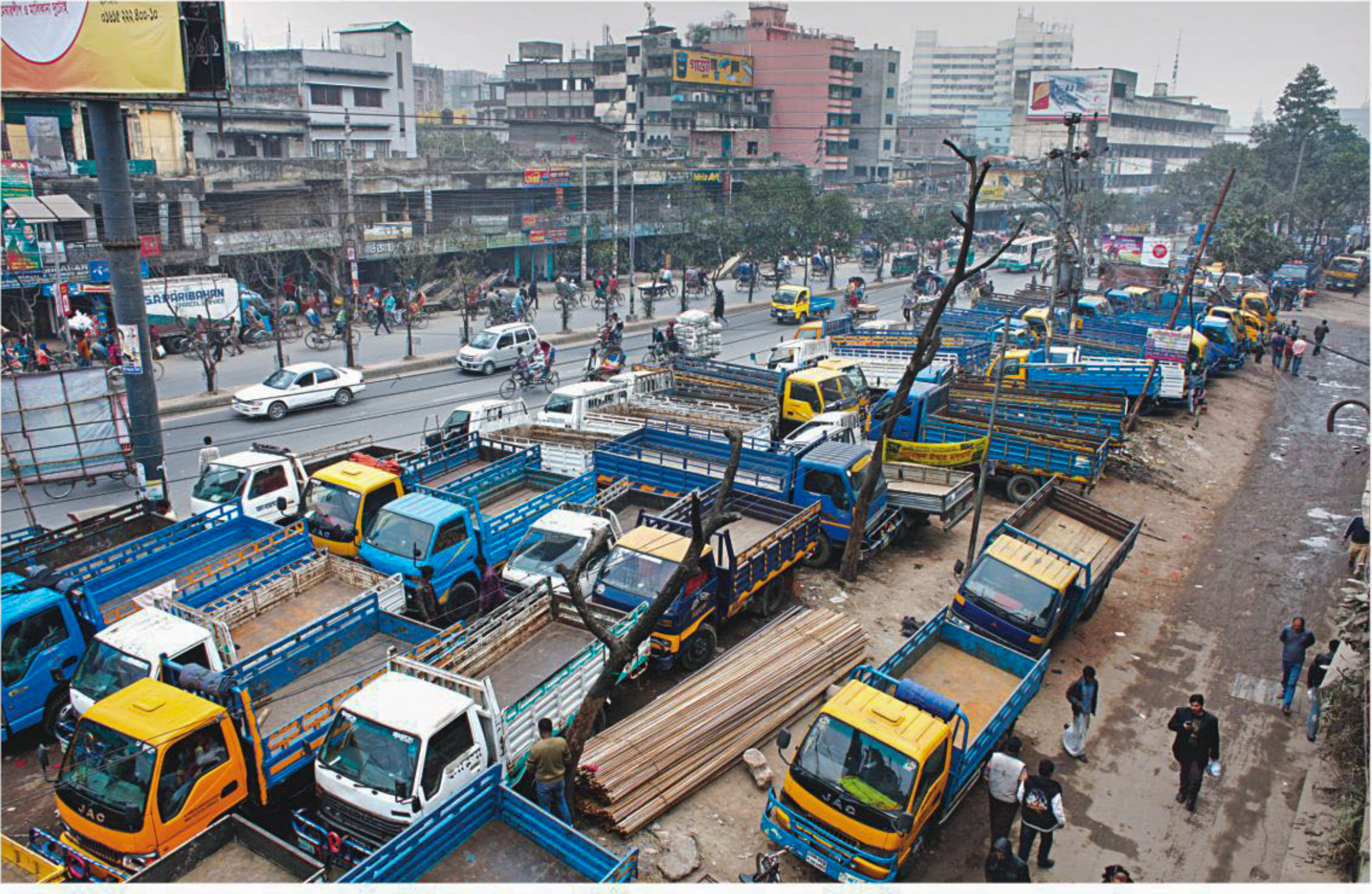
From a retreat of the local residents, Tantibazar Park in Old Dhaka has turned into a parking place of trucks over the last one decade, allegedly with the backing of the ruling party men. The photo was taken recently.

The order, a copy of which The Daily Star obtained, said the decision was taken at the approval and instruction of appropriate authorities and warned of steps otherwise.