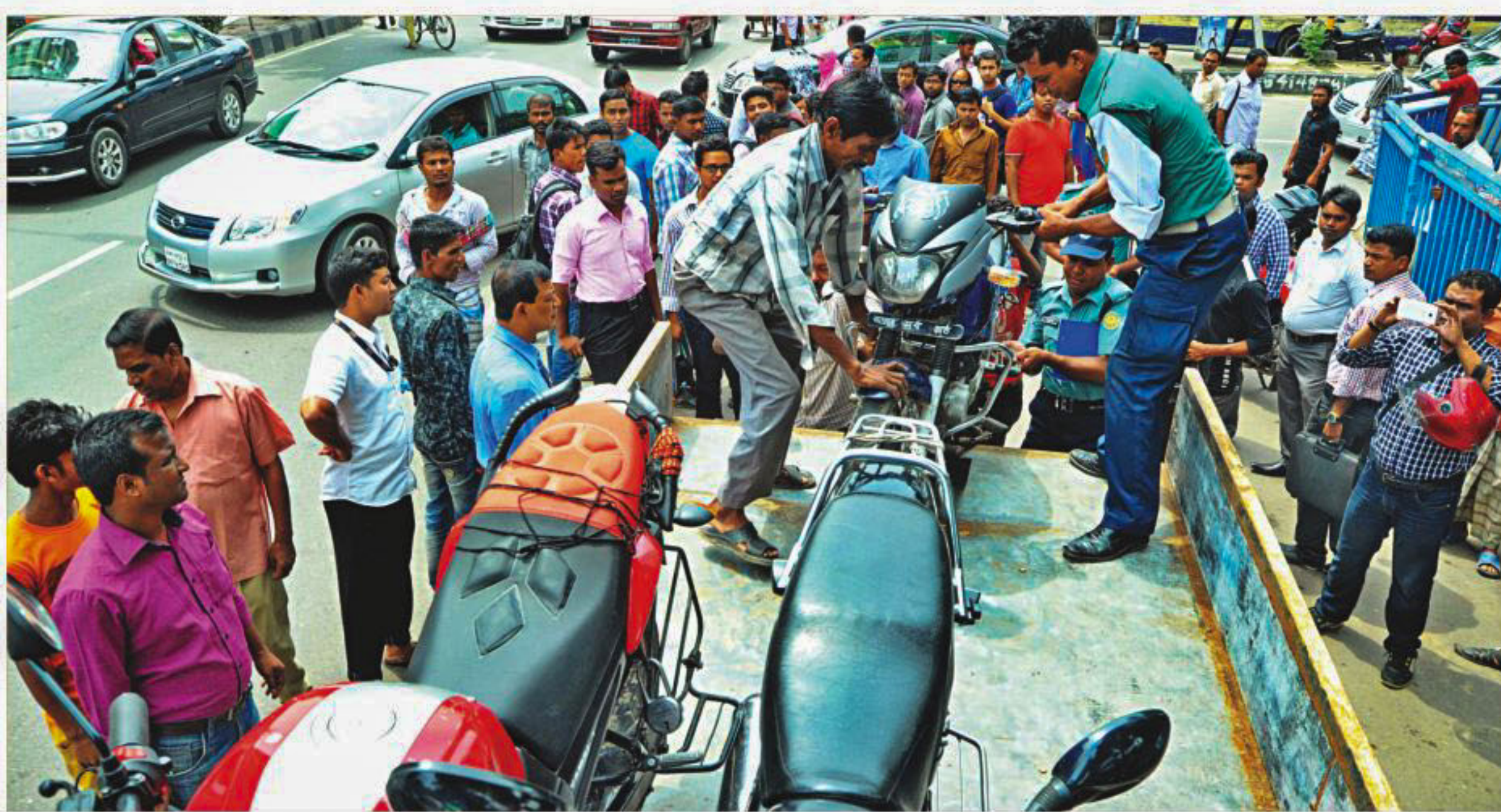
Police take away motorcycles they seized for the violation of the temporary ban on motorbikes on streets of the capital. The ban was imposed as Dhaka city goes to polls tomorrow. The photo was taken at Farmgate yesterday.