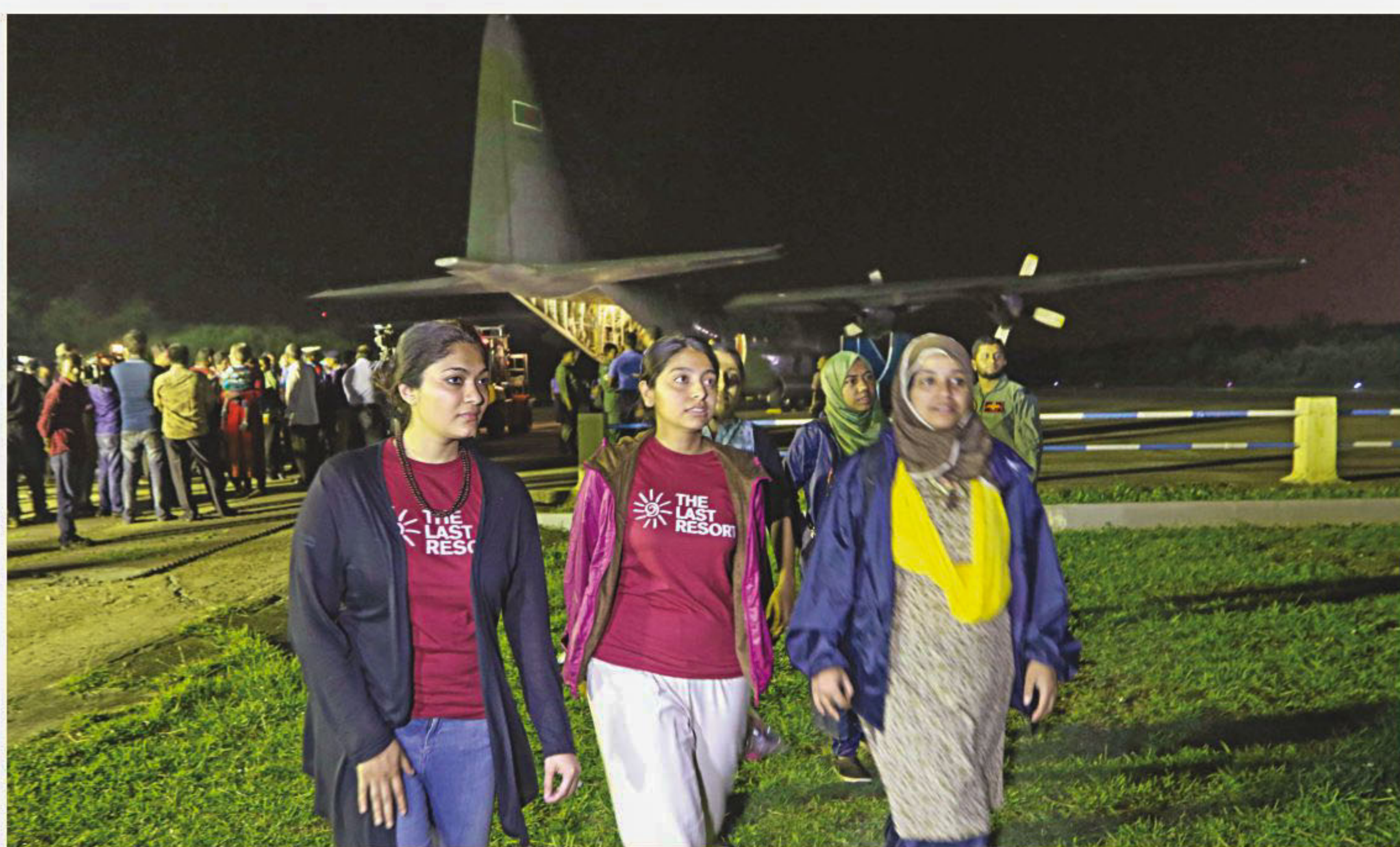
Forty-eight Bangladeshis return from earthquake-hit Nepal yesterday getting a ride on a Bangladesh Air Force cargo plane that went to Kathmandu to deliver aid.