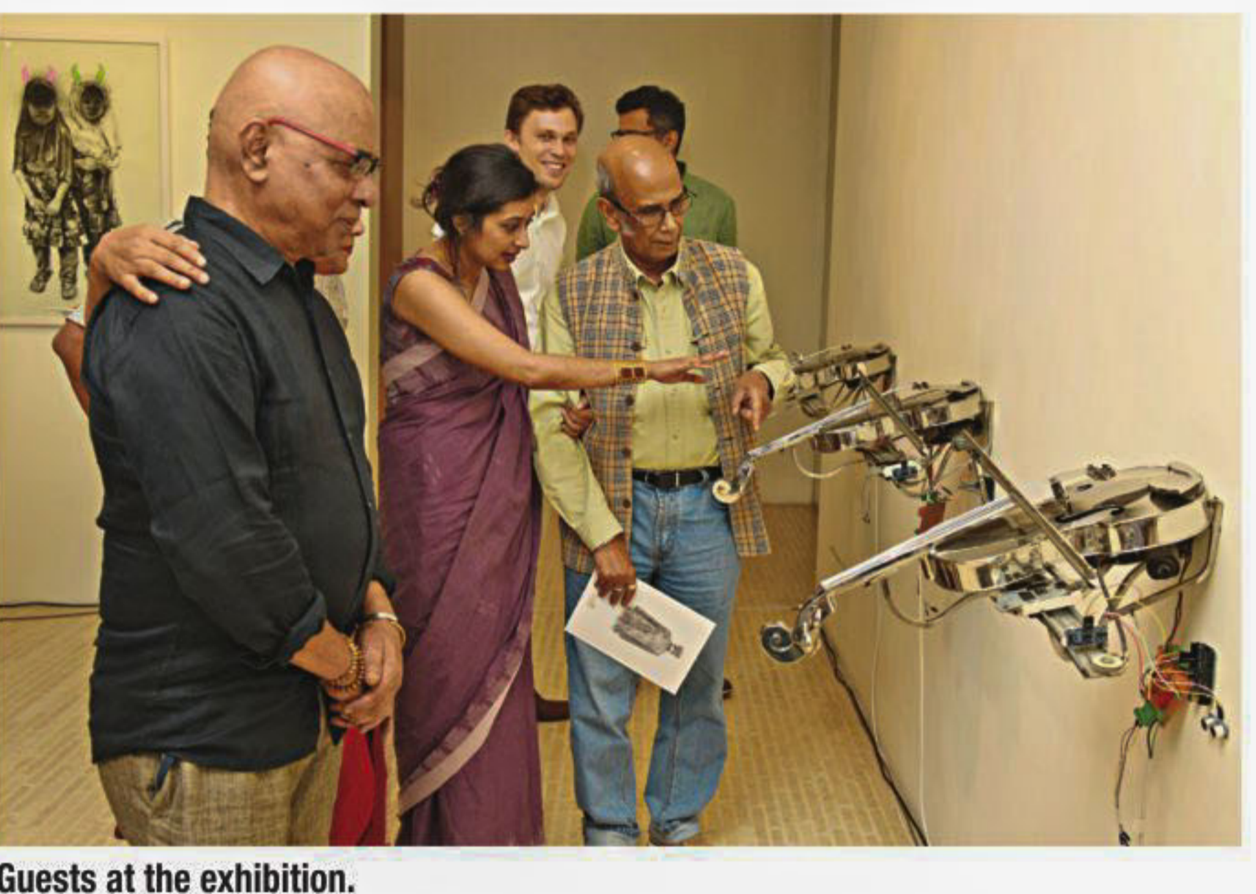
Guests at the exhibition.

A CORRESPONDENT Bengal Art Lounge has organised "Dust to Dust (2010-2015)", a solo exhibition of installations, objects and drawings by Mahbubur Rahman. Eminent writer Syed Shamsul Haq and noted painter Shahid Kabir jointly inaugurated the exhibition recently. Mahbubur Rahman's 25 years of creative practice have established him as one of Bangladesh's most radical and challenging artists. Rahman has pioneered a cross-media approach in visual arts. "Dust to Dust (2010-2015)" is conceived as an illustration of the artist's polymorphous endeavors: from charcoal drawings to complex installations with fabricated objects mixing sound and light, the exhibition opens a window on Rahman's ambitious experimentation. Part new exhibition, part retrospective, the show blends previously unseen artworks with selected pieces that have been exhibited on rare occasions. It is the first time, for instance, that "I was told to say these words", a major installation created for the Venice Biennale in 2011, will be on display in Bangladesh. The complicated relationship between the aspirations of the self and the norms enforced by religion and society, or the duality of power and oppression in the post-colonial context of South Asia, are among the questions hinted at in this exhibition.