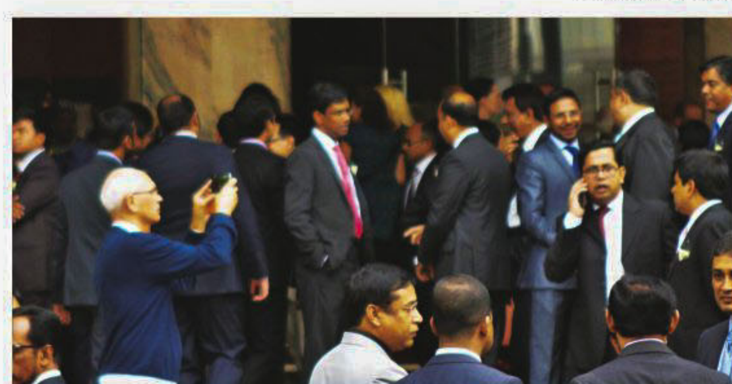
Panicked people get out of The Westin hotel in Gulshan-2 yesterday following the earthquake.