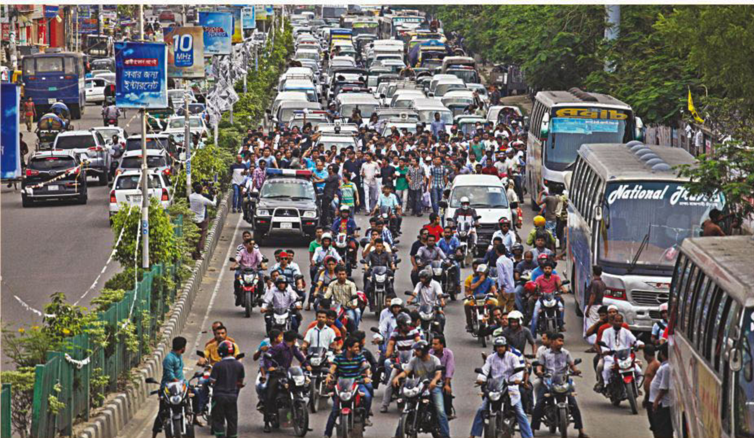
People on motorbikes spearhead BNP Chairperson Khaleda Zia's motorcade as she resumes campaigning for party endorsed candidates. The photo was taken on Pragati Sarani yesterday.