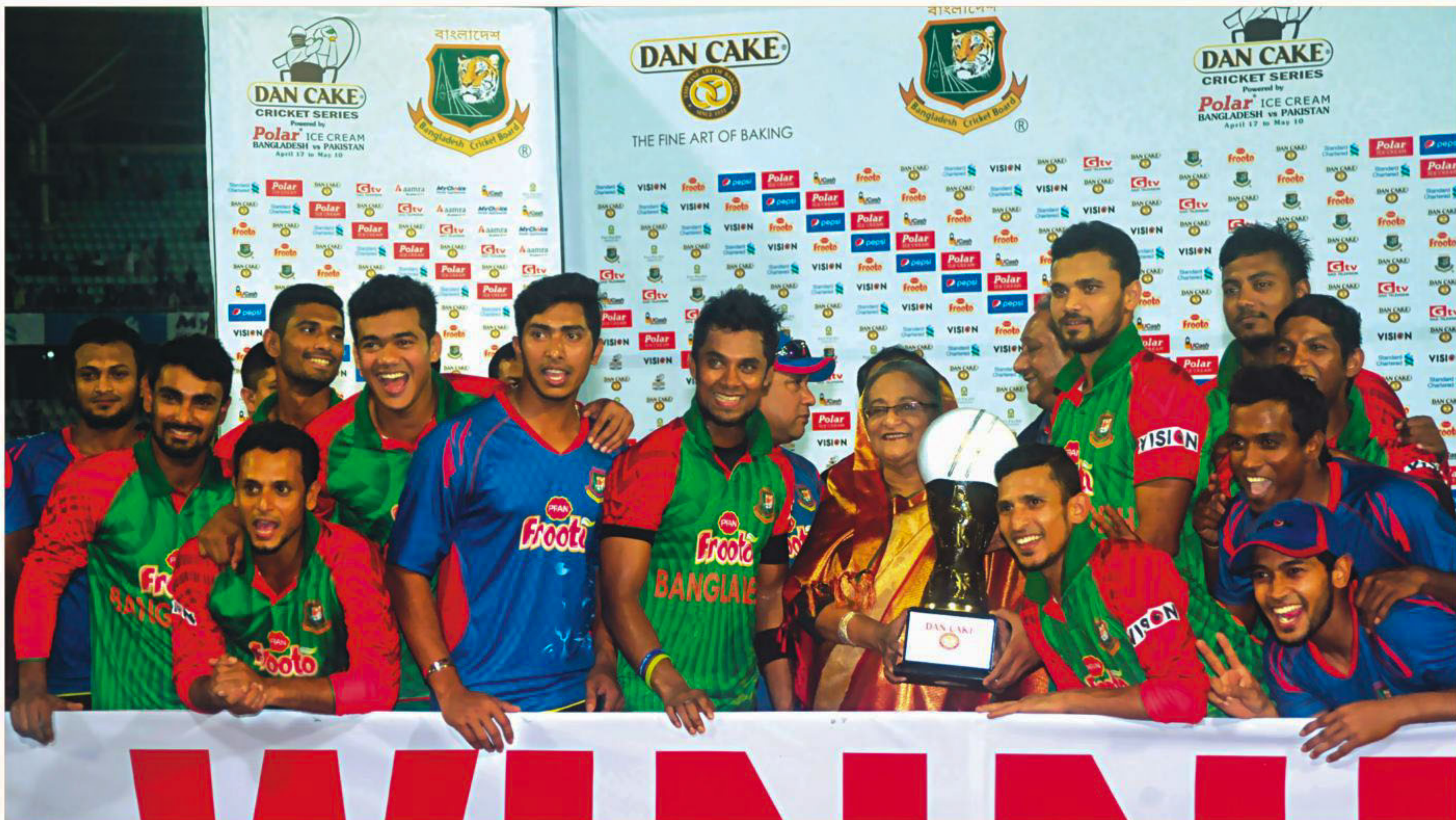
Prime Minister Sheikh Hasina holds the trophy and poses with the Tigers for photos at the Mirpur Sher-e-Bangla National Cricket Stadium yesterday after the Bangladesh cricket team comprehensively beat Pakistan in the only T20I of Pakistan's tour of Bangladesh.