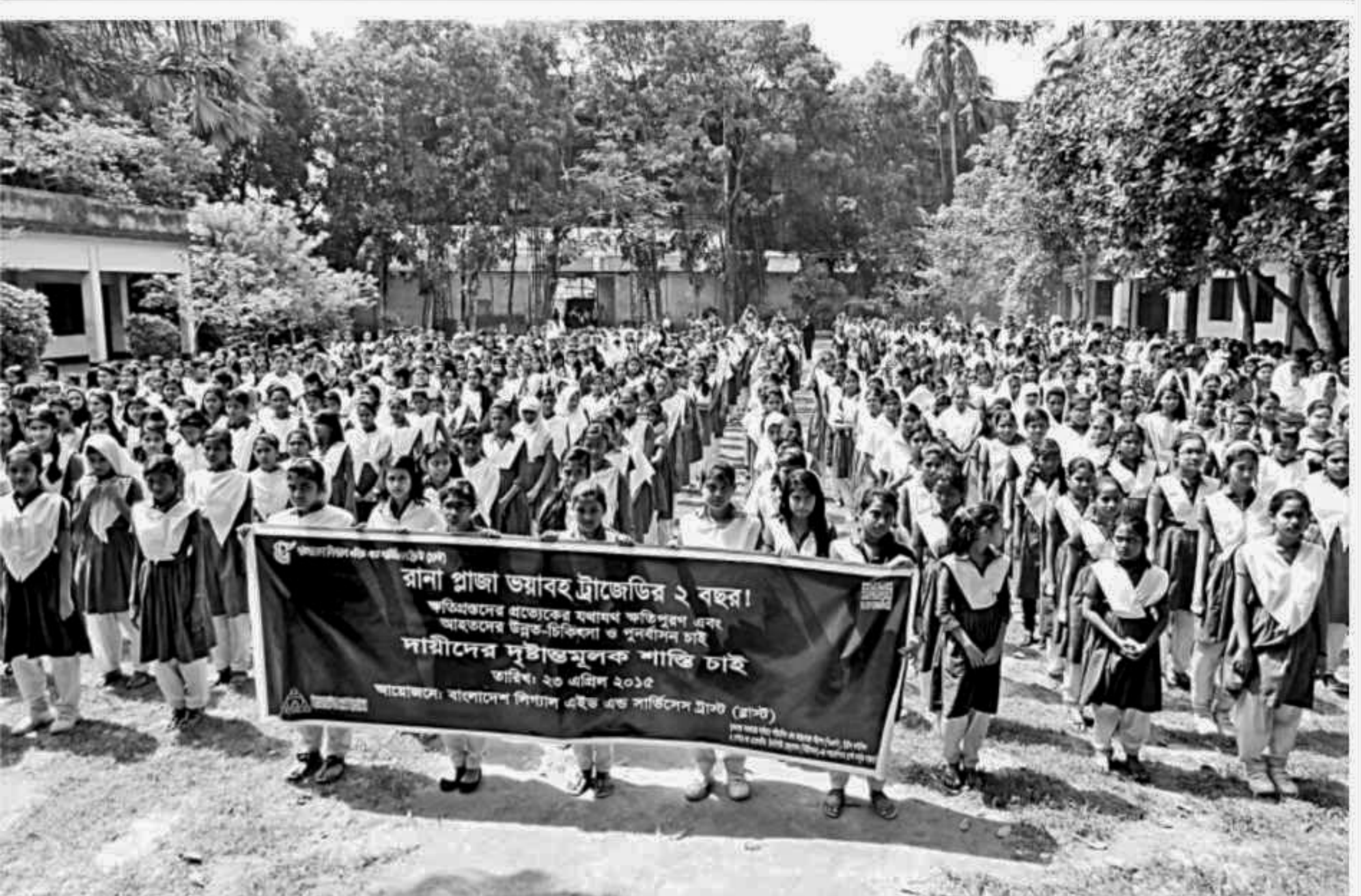
Students of Sarada Sundari Girls' High School in Faridpur stand in solemn silence for one minute in remembrance of the victims of a garment factory collapse at Rana Plaza in Savar under Dhaka district on April 24 in 2013. Bangladesh Legal Aid and Services Trust organised the programme demanding punishment of the people responsible for the tragedy that led to the reported death of 1,129 people and injuries to many others, and adequate compensation for the victims.