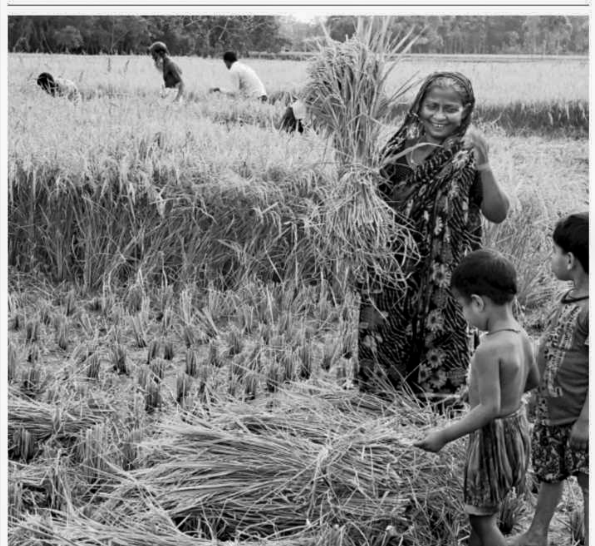
Farmers harvest boro paddy at a field in Gharinda of Tangail Sadar upazila that sees good yield of the crop this season.

affect law and order as occupants are in possession of railway land for decades and doing business there. I met the railway minister and proposed to him that the department keep under possession only the land it needs for operation and the rest of the land be legally leased for long term to occupants for revenue." Expressing ignorance about continuation of market construction on railway land, he said, "The railway authorities concerned did not bring the matter to my notice." Earlier mysterious fires on the nights of January 25 and 26 destroyed two big makeshift markets of cloth and groceries on railway land. Taking opportunity of the sympathetic situation, a syndicate of big traders started illegal construction of 30 multi-storied permanent markets on the railway land in Saidpur, prompting the BR authorities to launch a massive eviction drive.