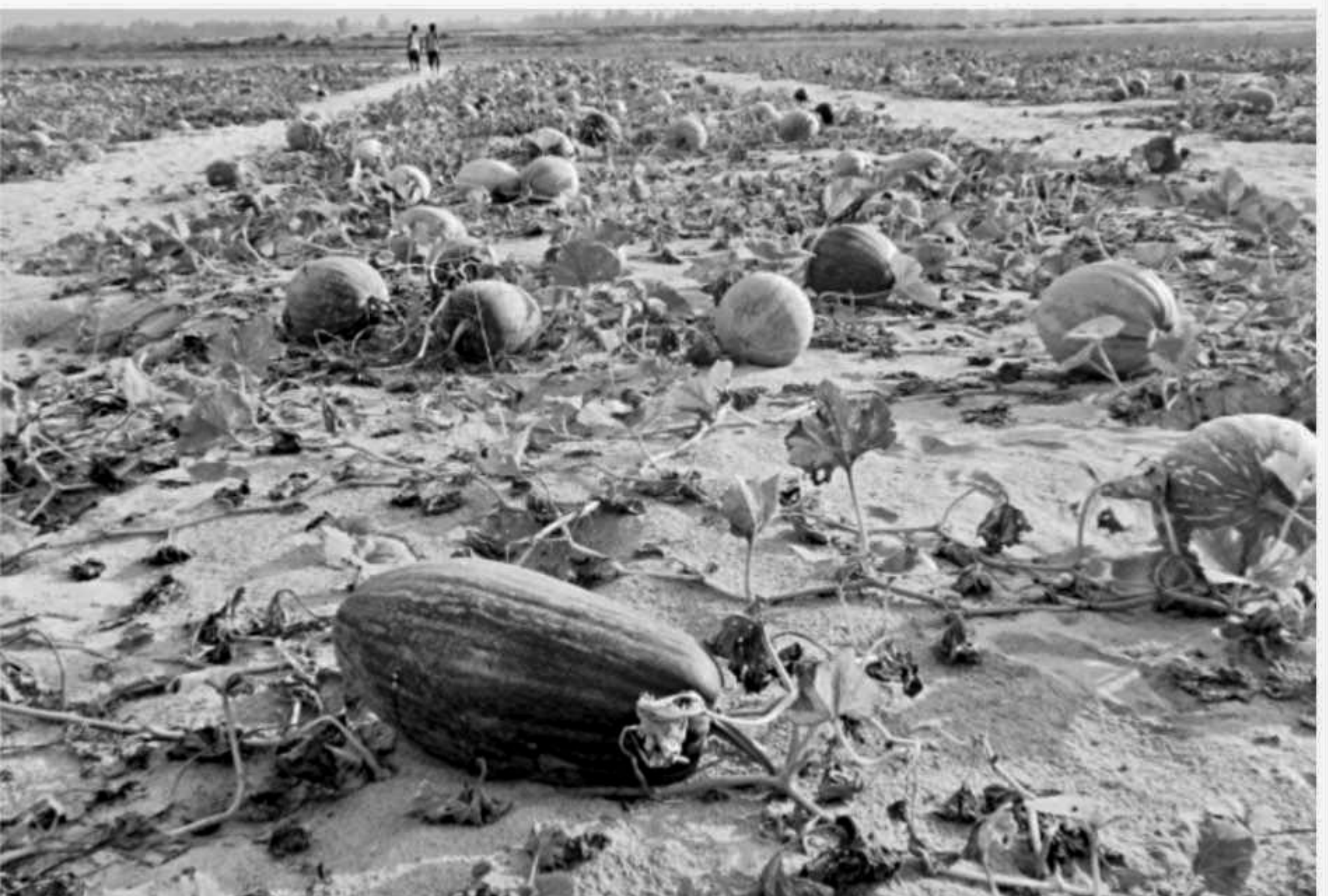
Pumpkin grows abundantly at a sandy land on the Teesta River basin area of Gobordhan village in Aditmari upazila under Lalmonirhar district, much to the happiness of landless farmers who cultivated the popular vegetable on the once unused land.

land. Little investment brings high profit. They need only seeds, some compost fertiliser and proper care of the crop. Deputy Director of DAE in Lalmonirhat, Safayet Hossain, said pumpkin cultivation on sandy land in char areas can play a vital role in mitigating poverty of the farmers. Wastage from pumpkin fields can fertilise the sandy land for cultivation of other crops, he said. Char farmers urged the government to provide necessary support, including seeds, fertilisers and insecticides, for increasing cultivation of pumpkin on sandy lands to alleviate poverty.