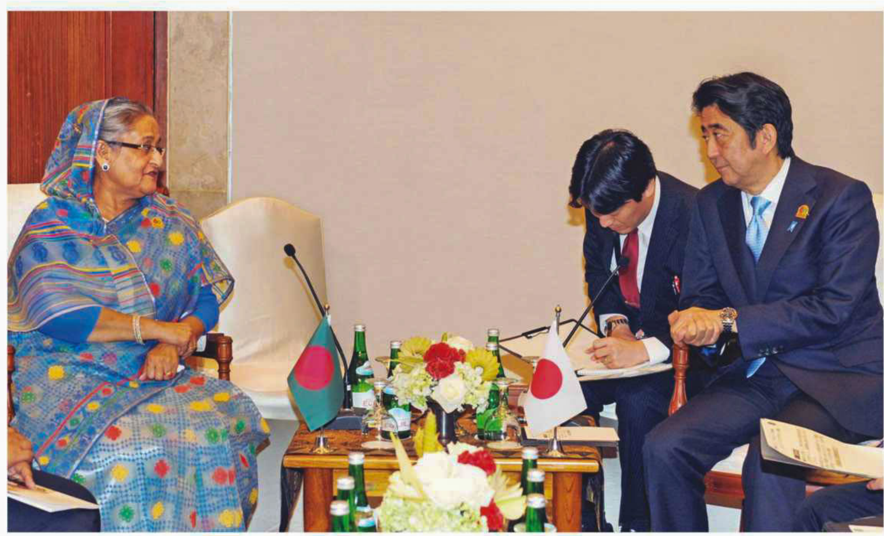
Prime Minister Sheikh Hasina meets Japanese premier Shinzo Abe on the sidelines of the Asian-African Summit in Jakarta yesterday.