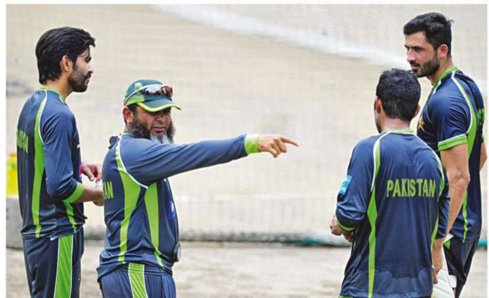
Pakistan's spin bowling coach Mushtaq Ahmed (2nd from L) will hope that his troops can take full advantage of Bangladesh's turning wickets to salvage some pride in the third and final ODI today.

"It's hurting but the game moves on. We have to forget the past. It may be a matter of just one good innings or one good spell."