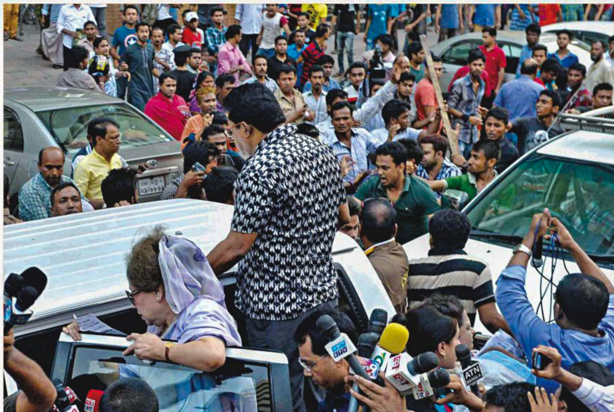
BNP Chairperson Khaleda Zia gets into her car as pro-Awami League activists go berserk and attack her motorcade at Karwan Bazar during a campaign for her party-backed mayoral hopeful in Dhaka North yesterday. More photo on page 2