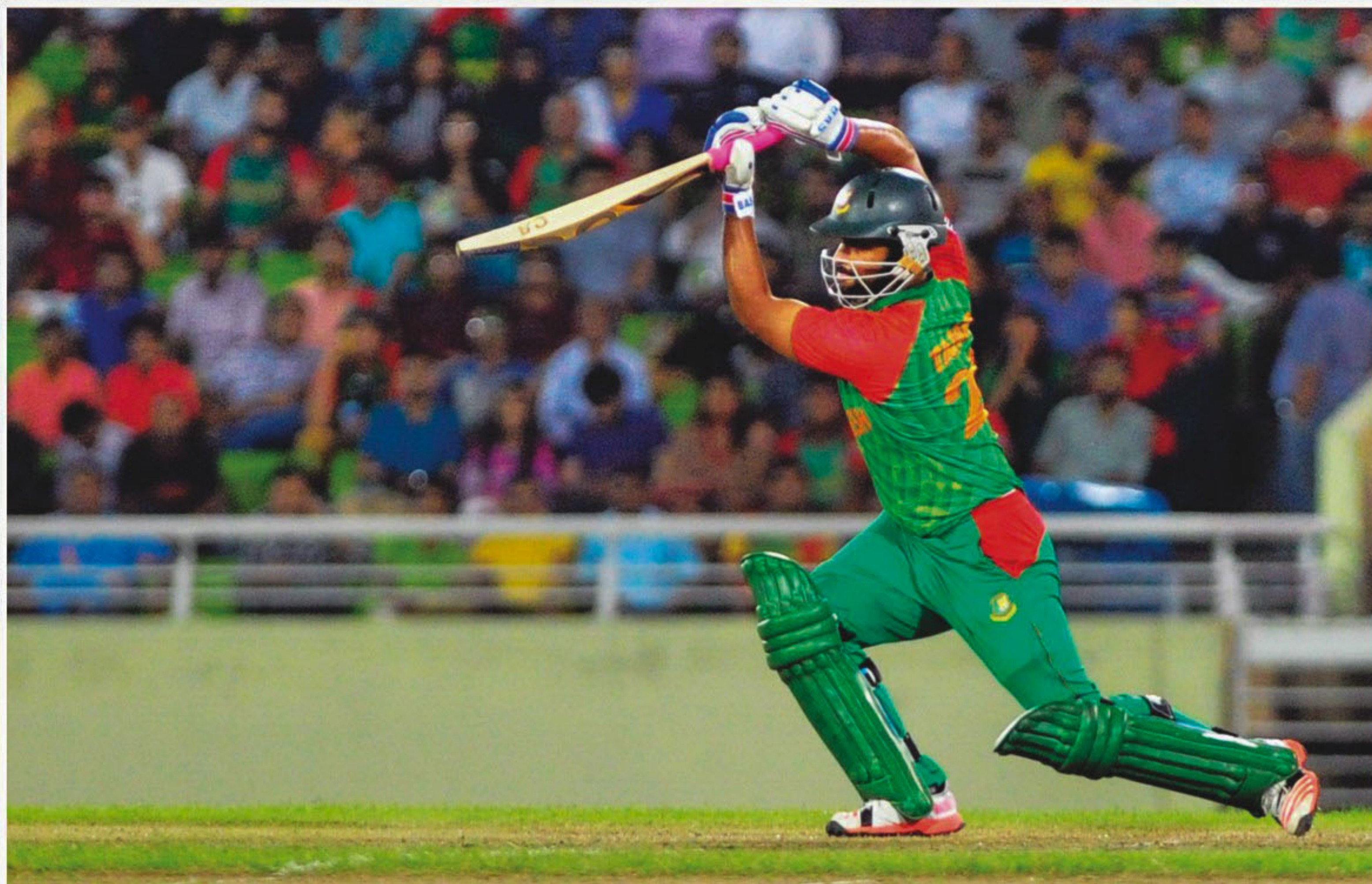
EVERY DAMN DAY: Bangladesh opener Tamim Iqbal is fully outstretched on way to his second consecutive century against Pakistan at the Sher-e-Bangla Stadium in Mirpur yesterday. Bangladesh defeated Pakistan by seven wickets with 71 balls to spare, heralding the start of a new era for the Tigers.