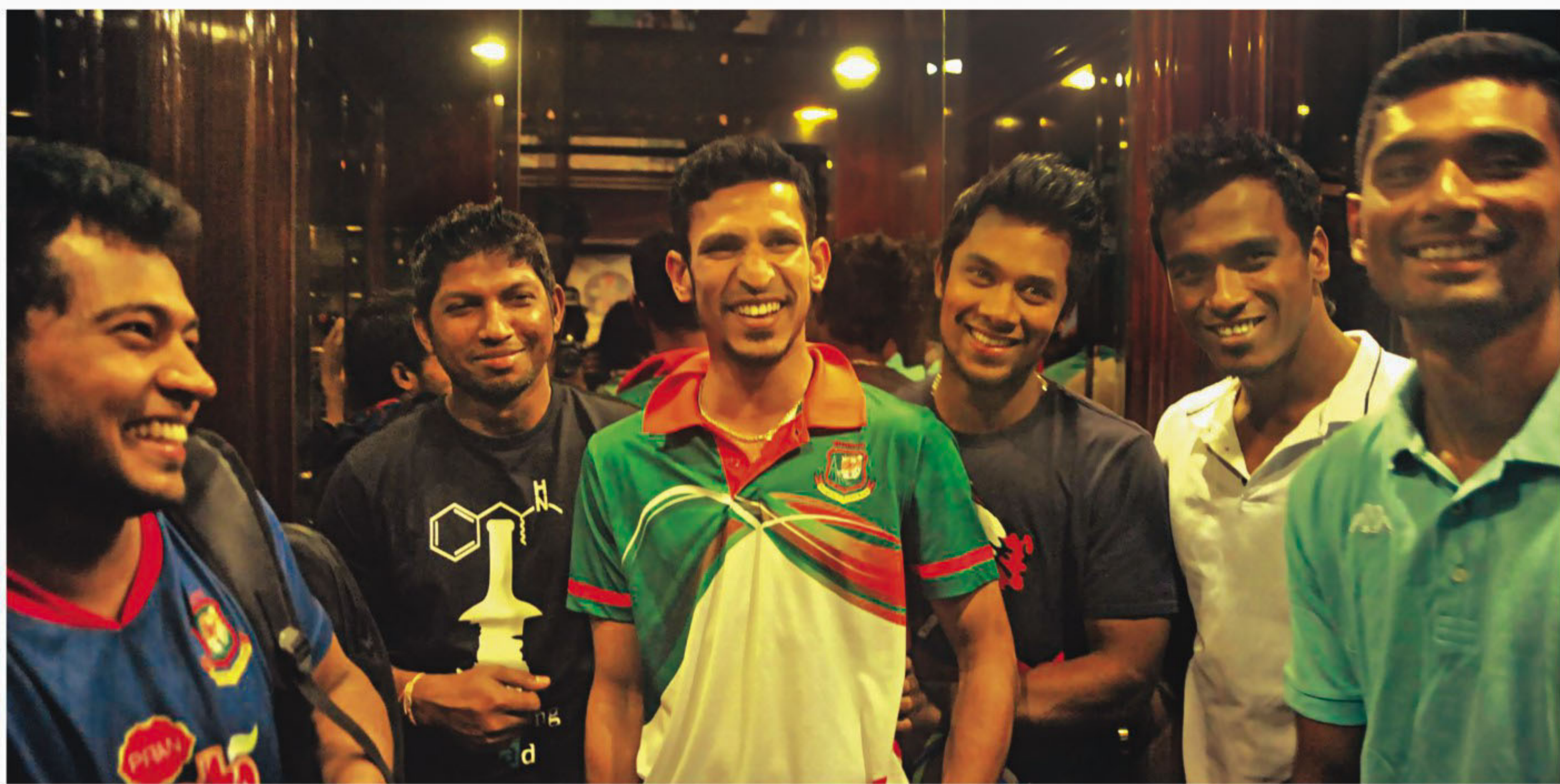
The Tigers were in a chirpy mood at the Pan Pacific Sonargaon Hotel yesterday, a day after their dominating 79-run victory against Pakistan in the first one-day international.

T: I am yet to reach the standard which I set for myself. I never portray myself as a big player, because I didn't do much yet. I have got the potential, so I should have done much better, but I have failed to justify my potential so far. Sometimes I get frustrated, but if I can achieve my goal in the next one or two years then everything will change. Hopefully I will be able to fulfill my dream.