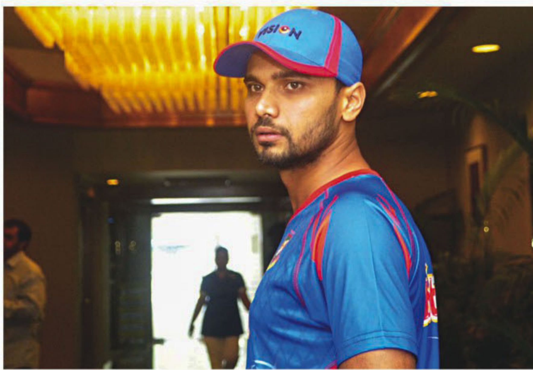
Mashrafe Bin Mortaza, a 24-carat Tiger, will be back at the helm in the second ODI against Pakistan today.

Can Pakistan's new-look side make a contest out of this series? Or will Bangladesh create history tonight? Either way, an exciting day of cricket is in store.