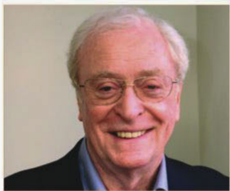
Sir Michael Caine

Cate Blanchett, Matthew McConaughey, Marion Cotillard and Sir Michael Caine are among those with films competing at this year's Cannes Film Festival. The line-up sees many returning auteurs, including new films from Gus Van Sant, Nanni Moretti and Jacques Audiard. Films from Woody Allen and new Pixar animation "Inside Out" will play out of competition, alongside Asif Kapadia's Amy Winehouse documentary. The festival begins on May 13, with a jury chaired by Joel and Ethan Coen. Festival director Thierry Fremaux announced the line-up in Paris on Thursday, simultaneously launching a campaign to stem the tide of 'selfies' on the red carpet. "We don't want to prohibit it, but we want to slow down the process of selfies on the steps," said Fremaux. "We think it's ridiculous and grotesque and really slows things down." "You never look as ugly as you do in a selfie," he added. Thursday's press conference follows earlier announcements regarding the opening film - "La Tete Haute" ("Standing Tall"), by French actress-director Emmanuelle Bercot - and the worldwide premiere of "Fury Road", the latest chapter in the