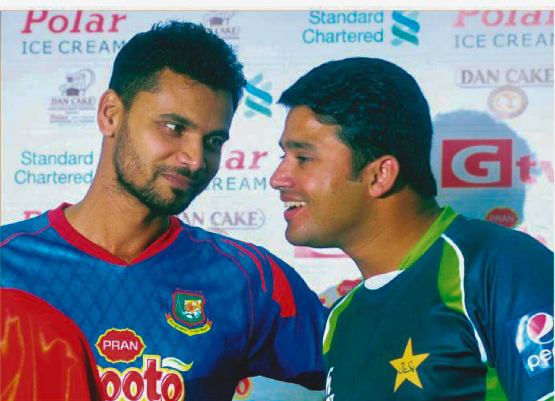
Bangladesh captain Mashrafe Bin Mortaza and his Pakistan opposite number Azhar Ali share a light moment during the unveiling of the three-match ODI series trophy at Mirpur yesterday. Stories on Page 18